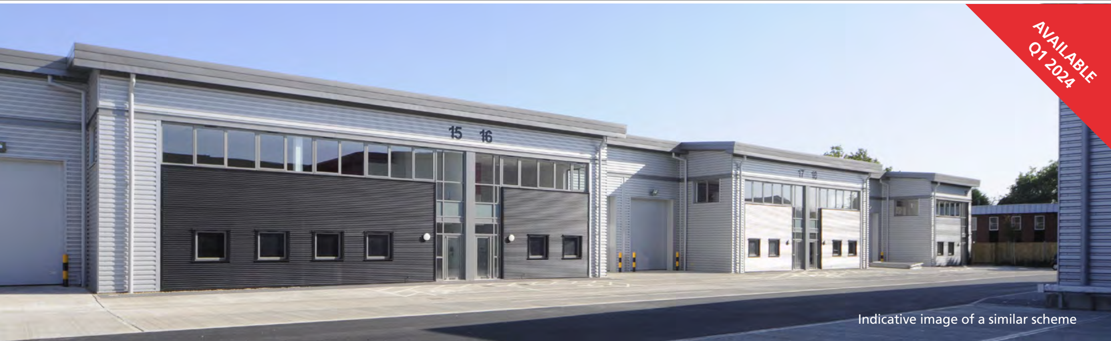
Indicative image of a similar scheme