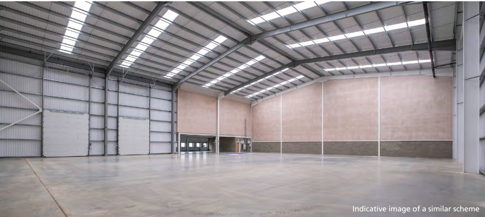
Indicative image of a similar scheme