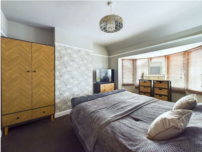
Bedroom One 10'10" x 10'10" (3.32 x 3.32)

With a door leading from the landing, a double glazed bay window to the front and a central heating radiator