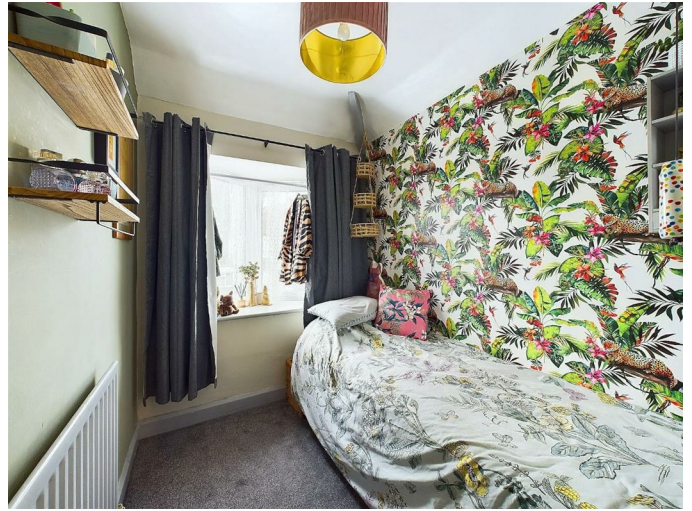
Bedroom Three 7'2" x 6'0" (2.19 x 1.83)

With a door leading from the landing, a double glazed window to the front and a central heating radiator