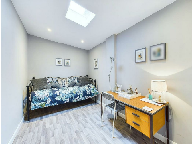
Snug 12'2" x 7'2" (3.72 x 2.19)

With a door leading from the kitchen, a door leading to the store room and a skylight window above