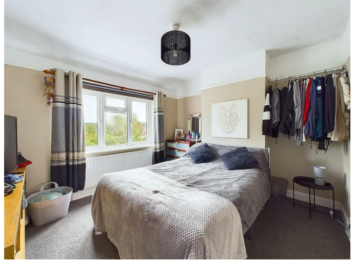
Bedroom Two 10'2" x 11'5" (3.12 x 3.49)

With a door leading from the landing, double glazed window to the rear and a central heating radiator