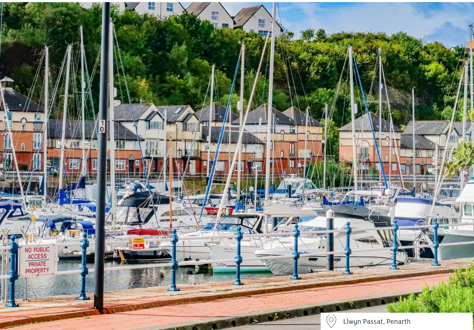
Llwyn Passat, Penarth