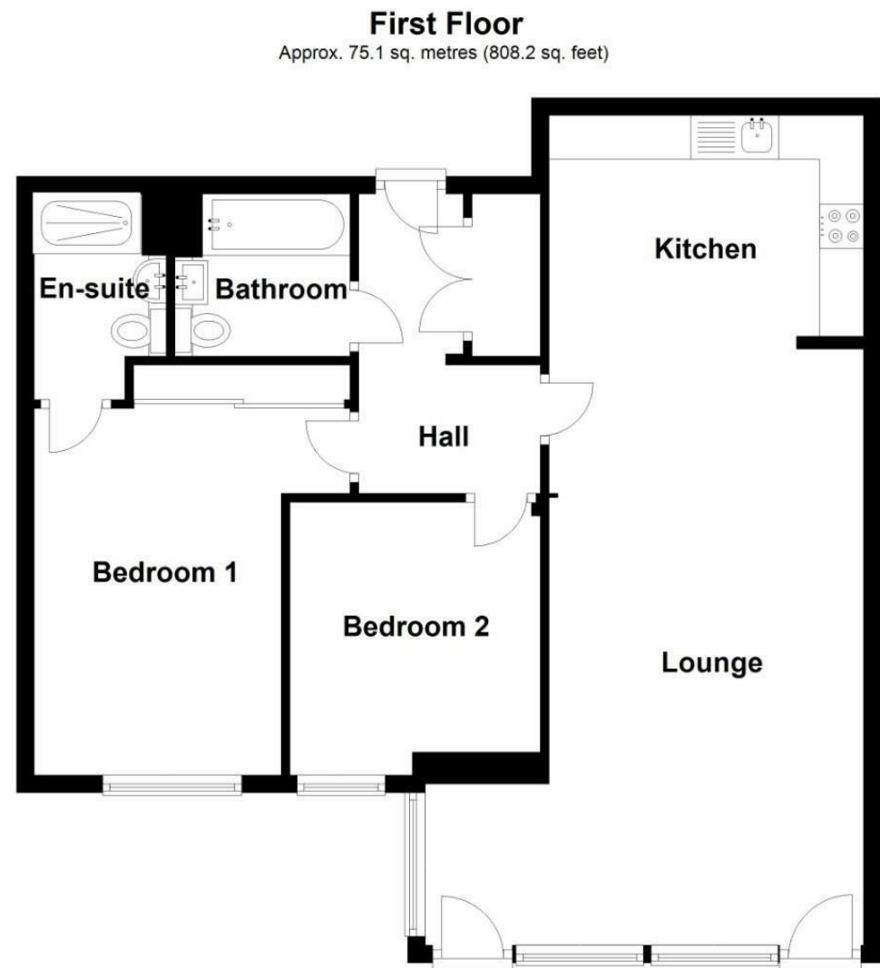
Total area: approx. 75.1 sq. metres (808.2 sq. feet)