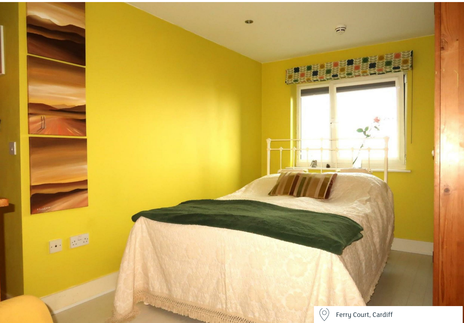
Ferry Court, Cardiff