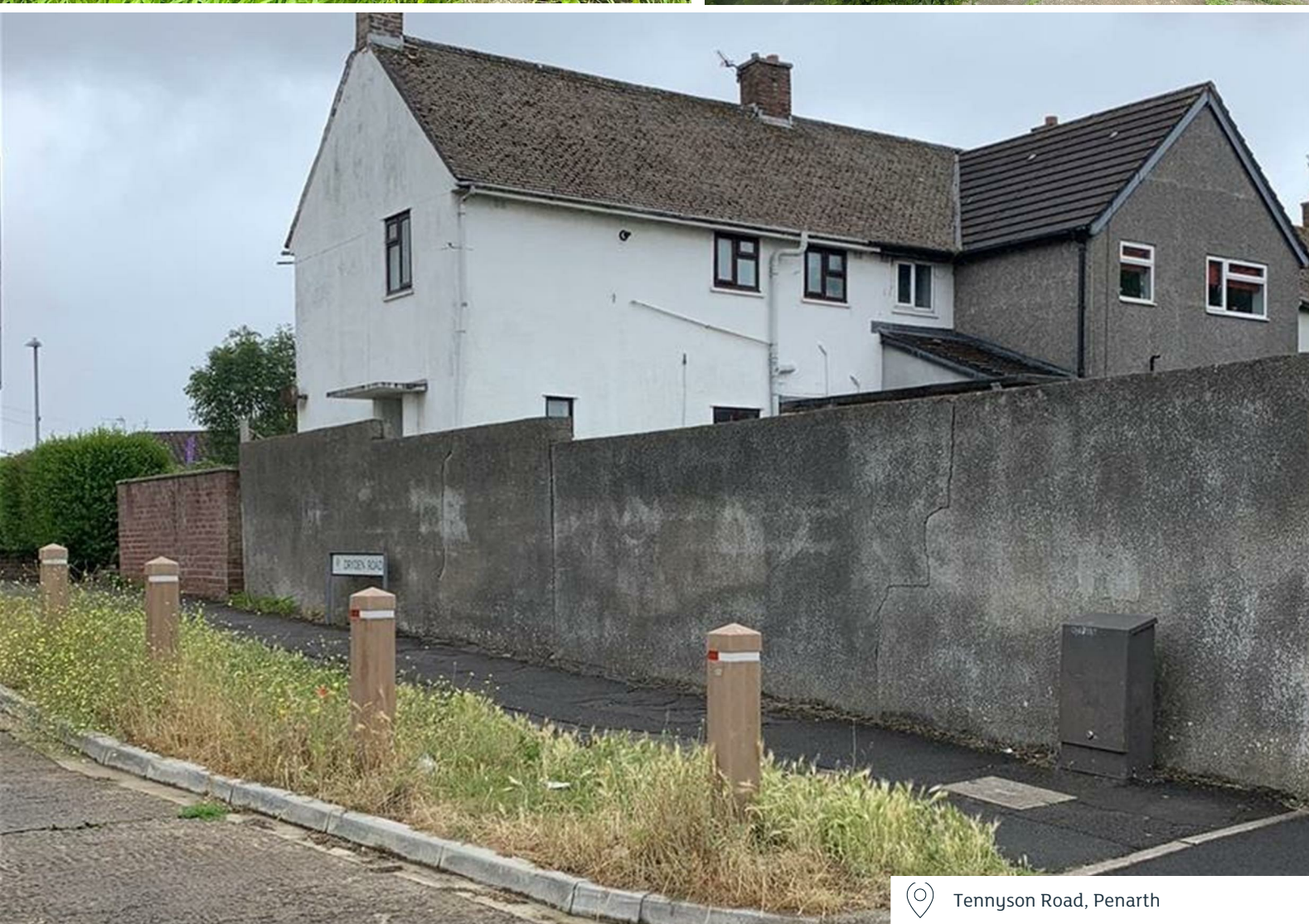
Tennyson Road, Penarth