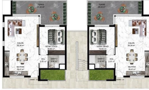
C BLOK ZEMİN KAT PLANI