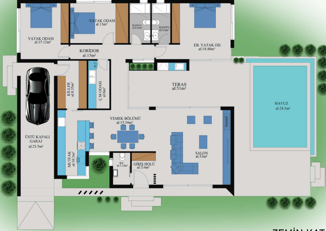
ZEMİN KAT PLANI 208 m²