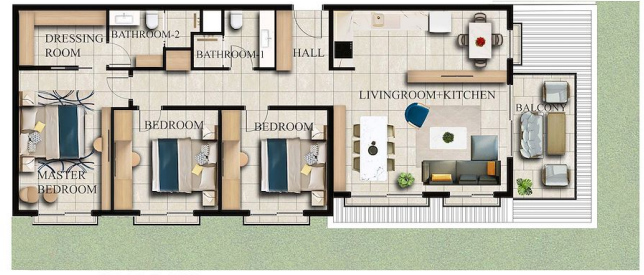
FIRST FLOOR x 1