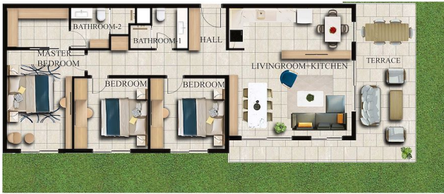
GARDEN FLOOR x 1