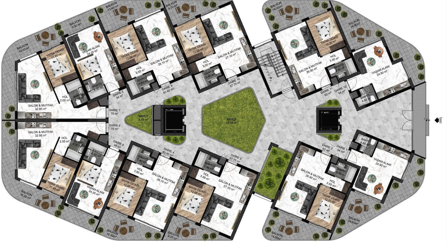
BLOK 6 ZEMİN KAT PLANI