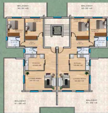
Penthouse Floor Plan