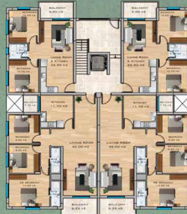
2+1, 3+1 Apartments Ground Floor Plan