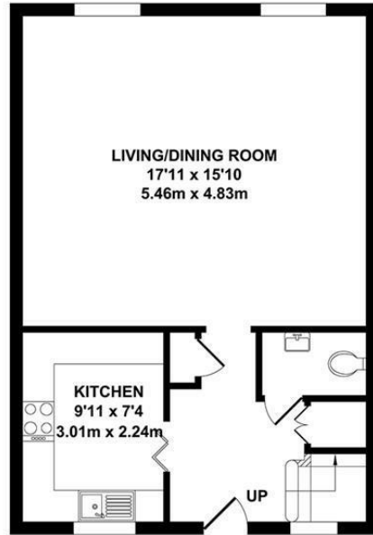
GROUND FLOOR APPROX. FLOOR AREA 473 SQ.FT. (43.90 SQ.M.)