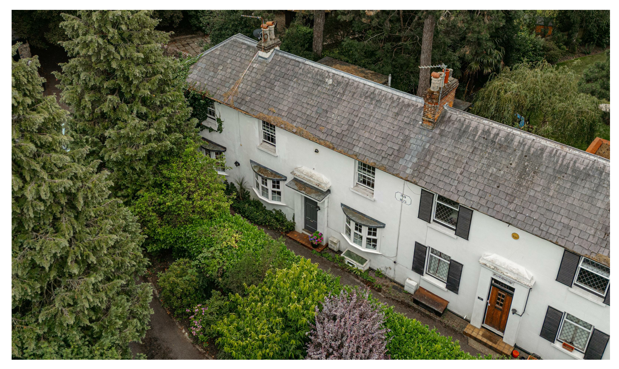
Worple Road, Epsom €700,000