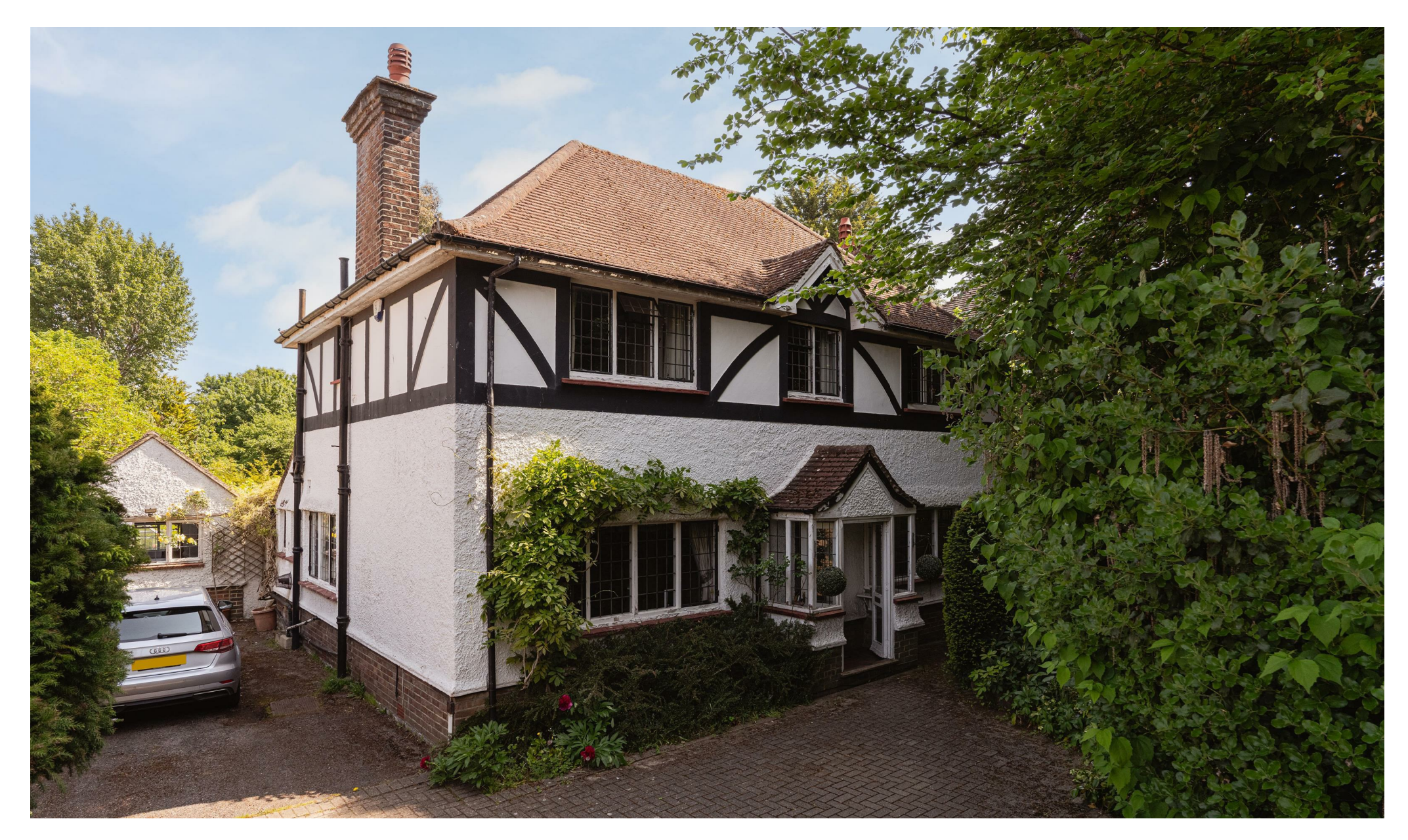
Smitham Downs Road, West Purley £825,000