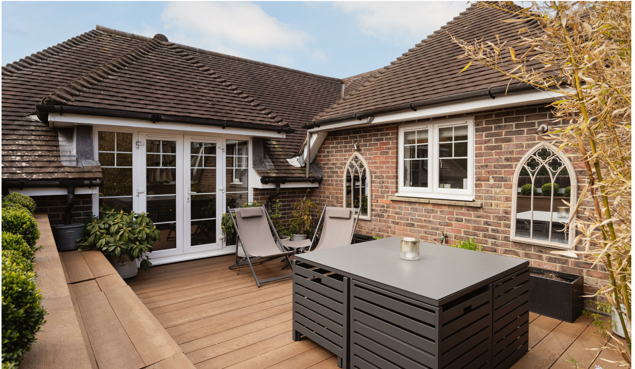
Kingswood Grange, Lower Kingswood £550,000