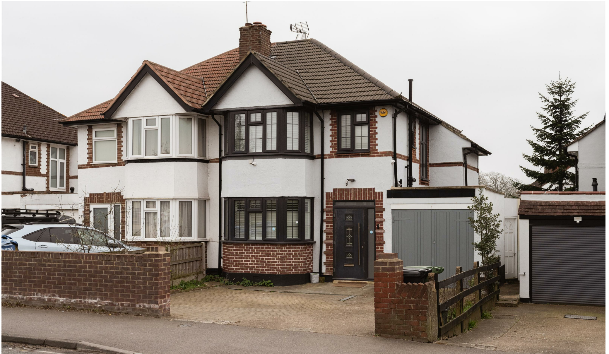
Kingston Road, Epsom £590,000