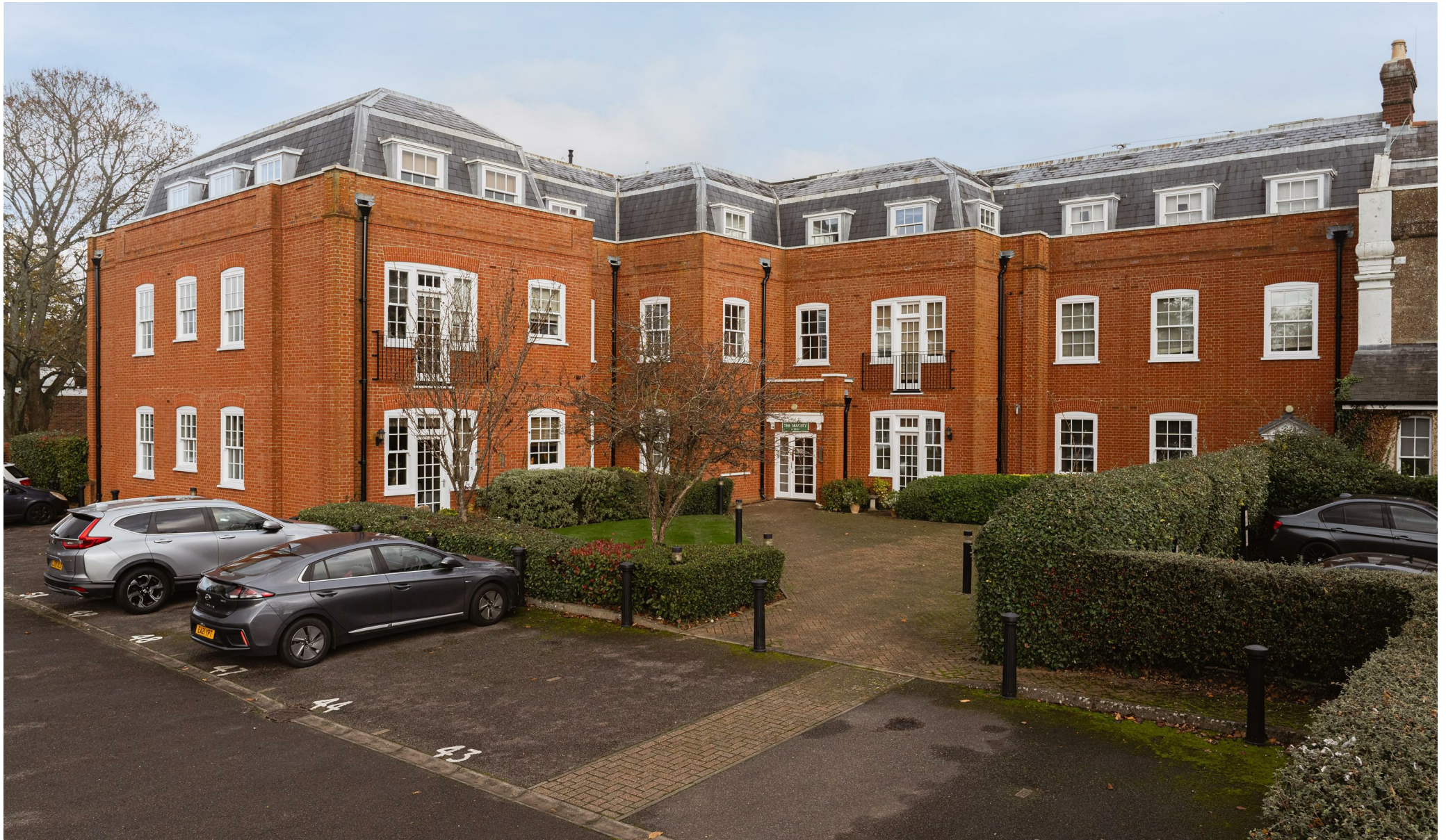
The Tracery, Banstead £400,000