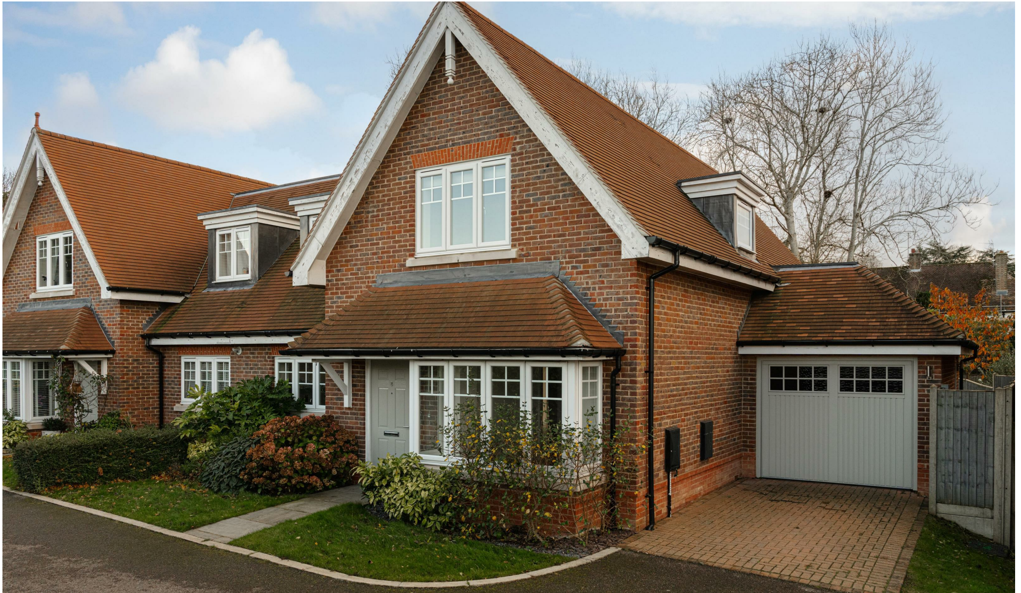
Nower Close, Epsom £800,000