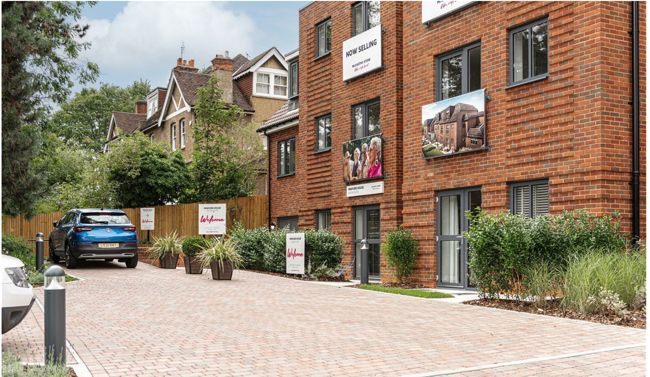
Woodcote Valley Road, Purley £299,000