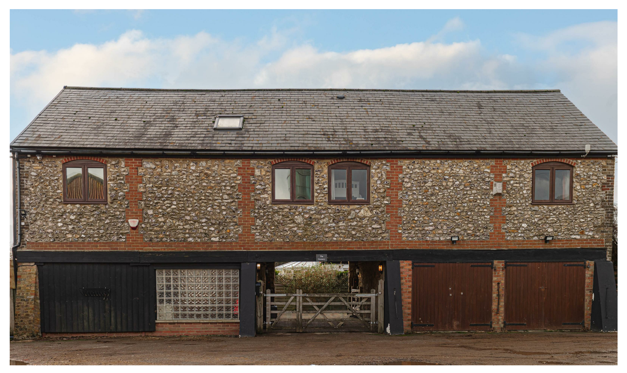
Pilgrims Lane, Caterham £950,000