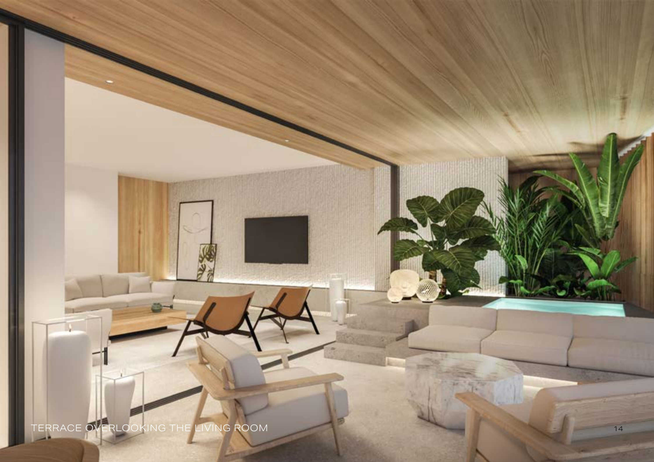
TERRACE OVERLOOKING THE LIVING ROOM