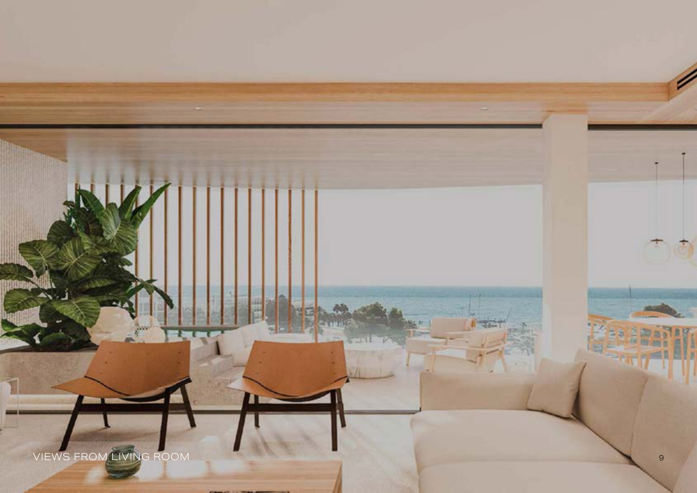
VIEWS FROM LIVING ROOM