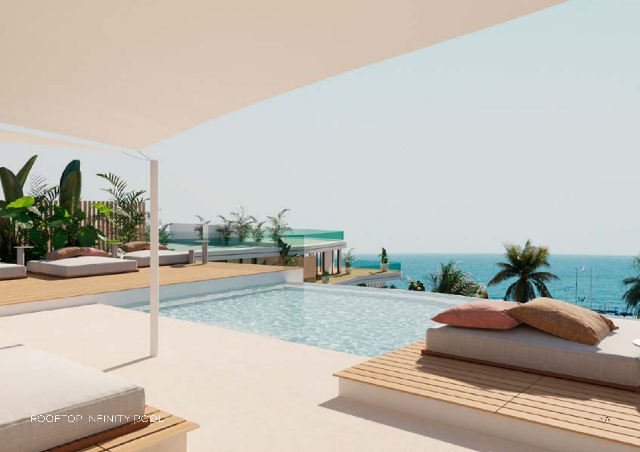
ROOFTOP INFINITY POOL