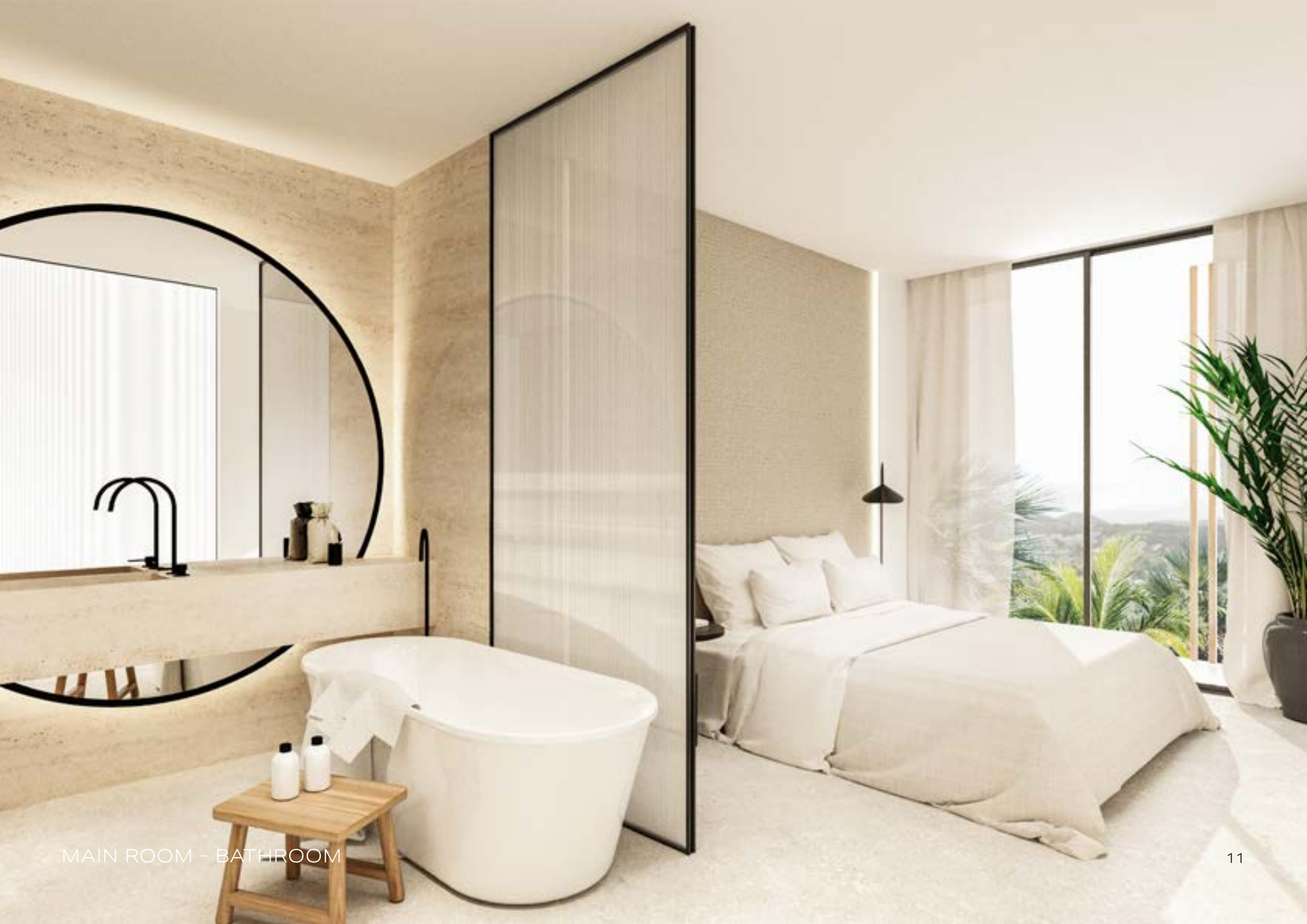
MAIN ROOM - BATHROOM