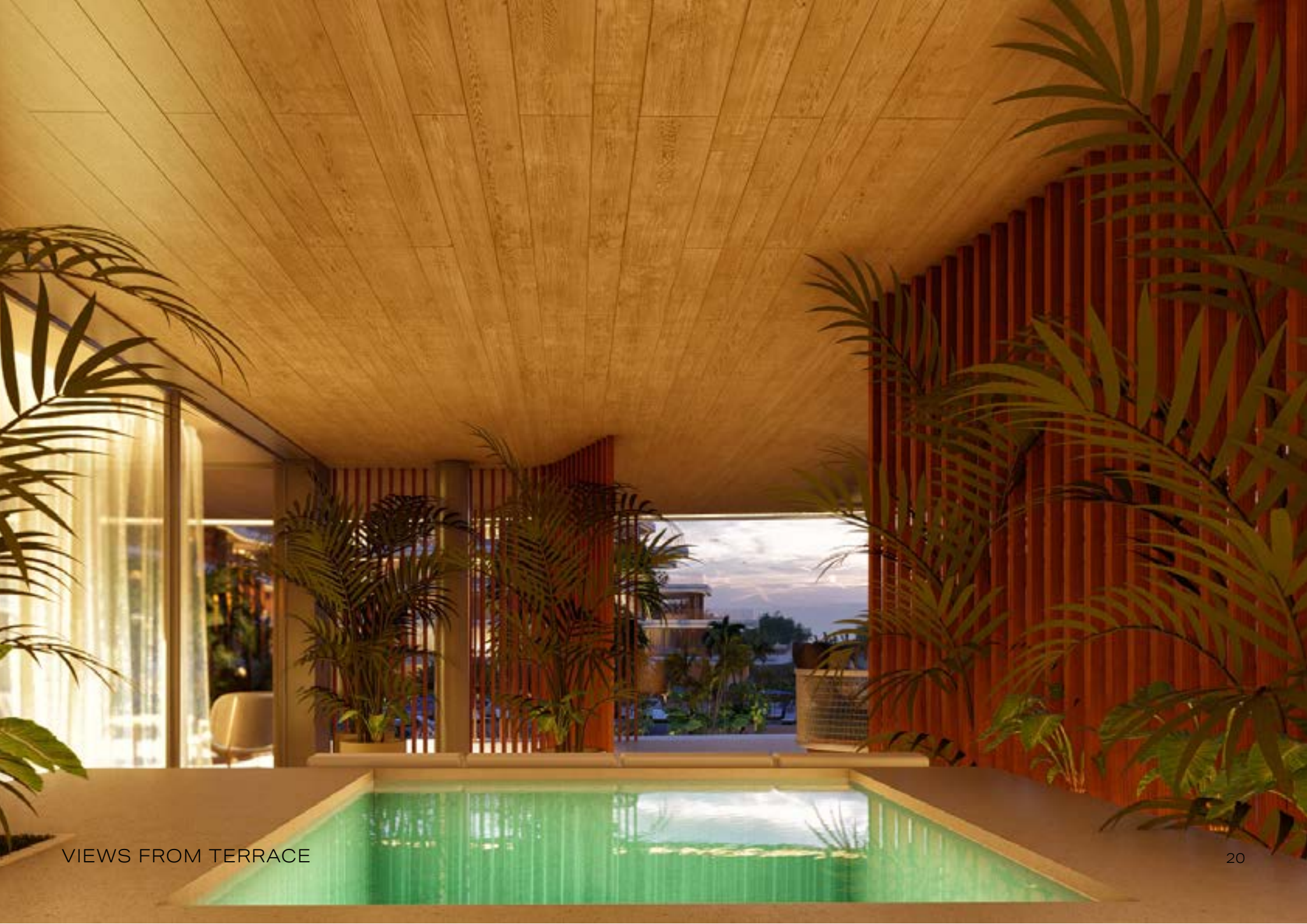
VIEWS FROM TERRACE