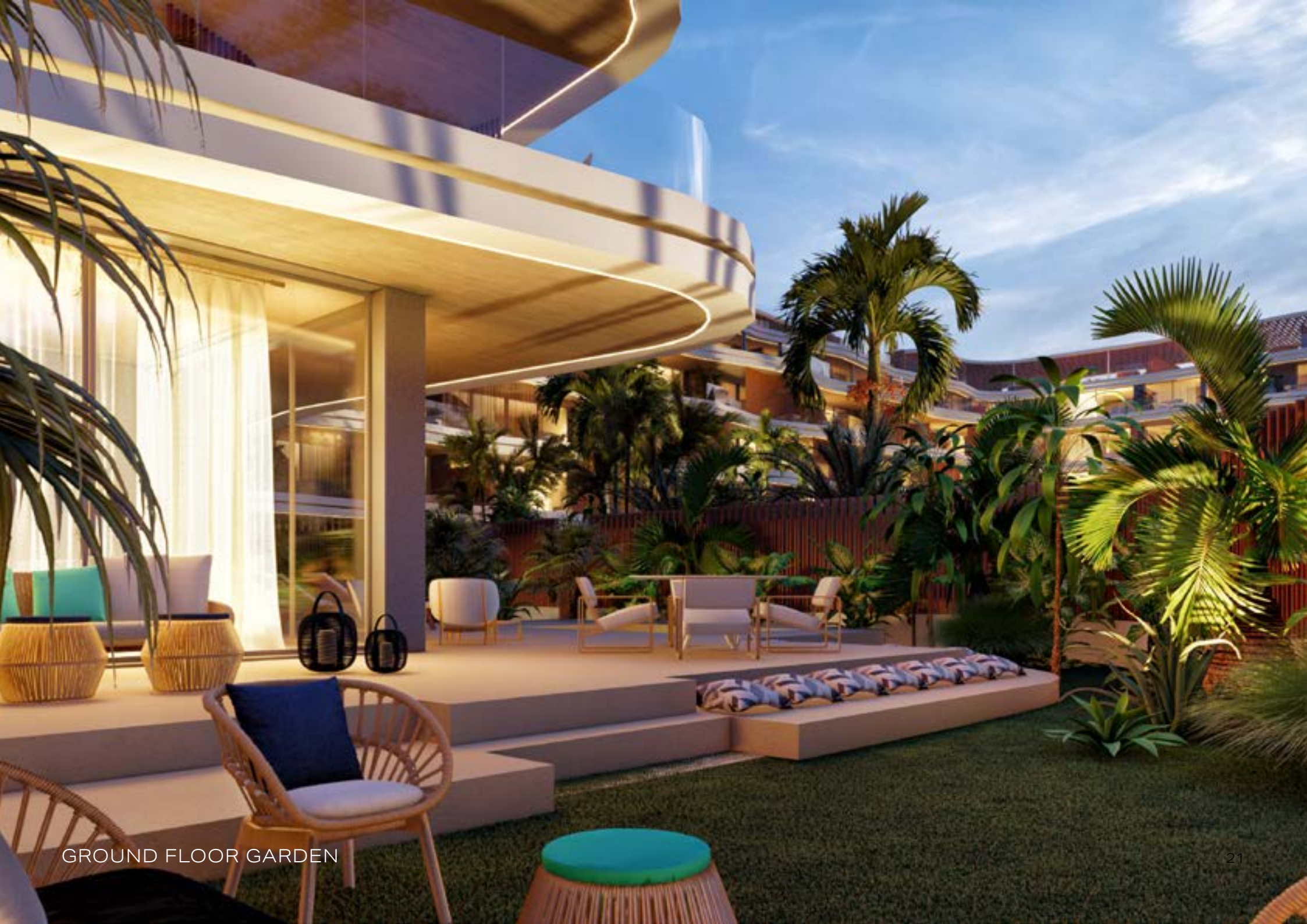
GROUND FLOOR GARDEN