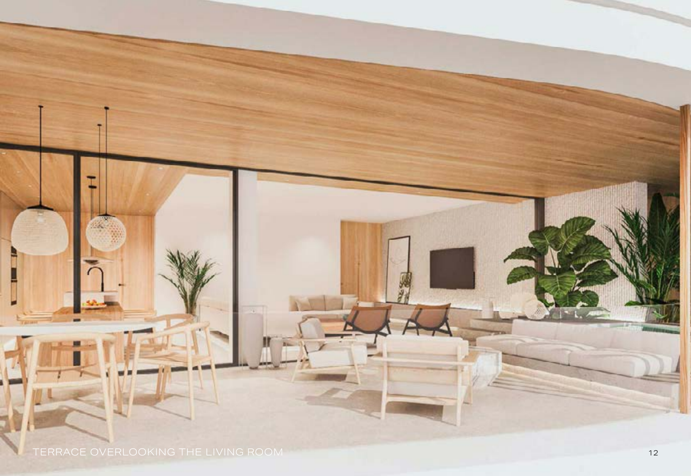
TERRACE OVERLOOKING THE LIVING ROOM