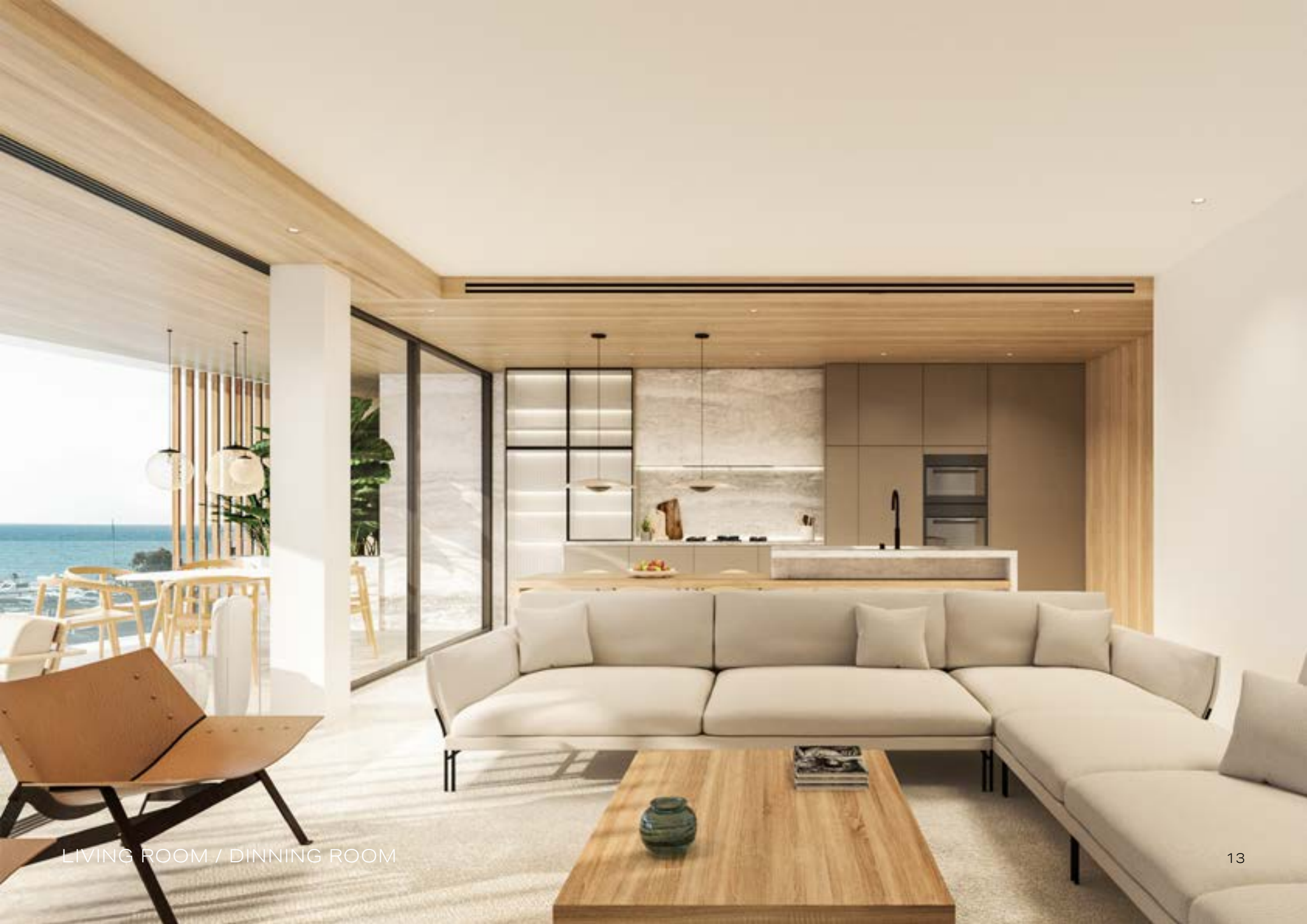
LIVING ROOM / DINNING ROOM