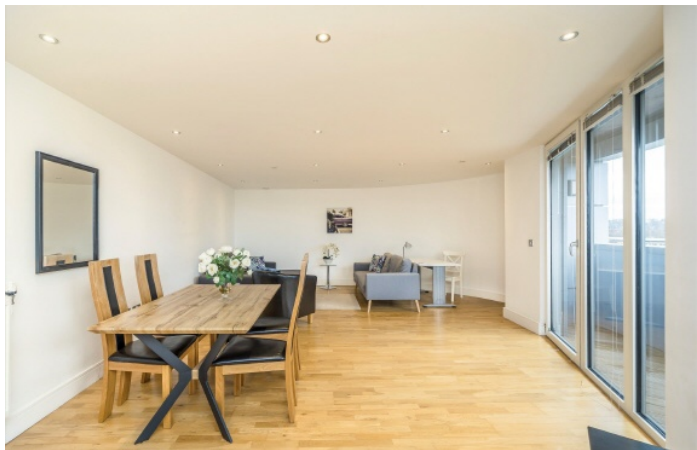
Dowells Street, SE10