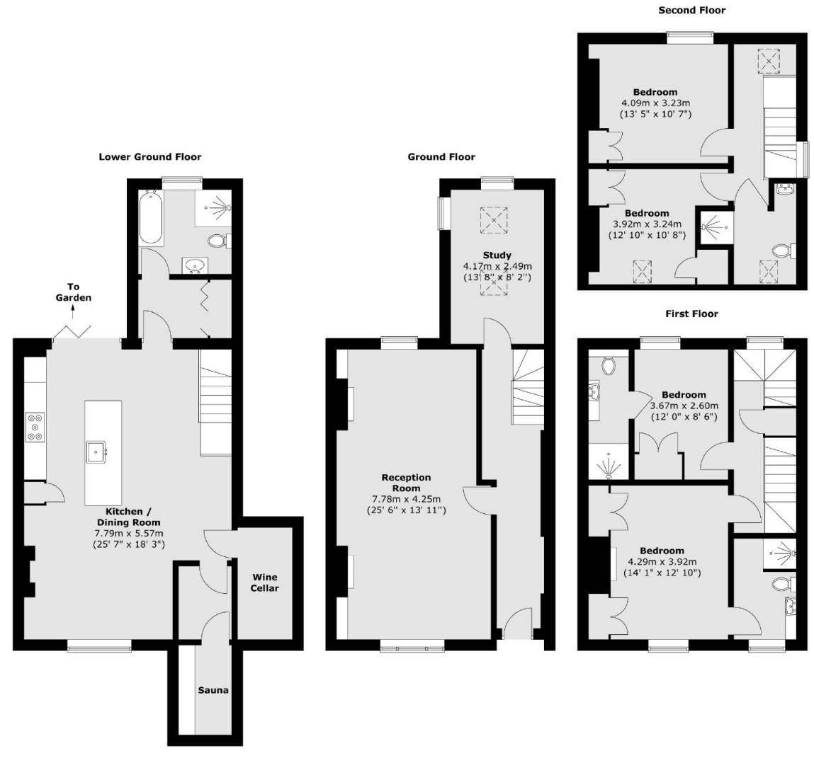
Total area (approx.) : 202 sq. m (2174 sq. ft)