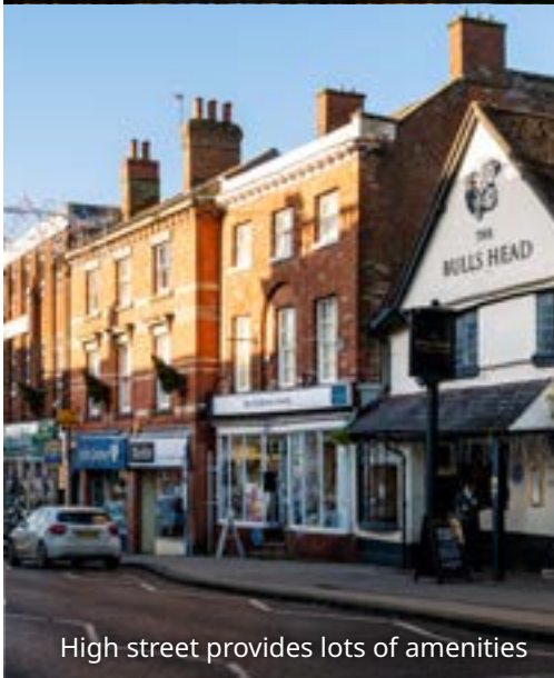
High street provides lots of amenities