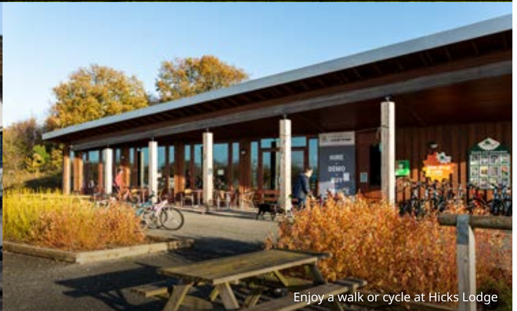
Enjoy a walk or cycle at Hicks Lodge