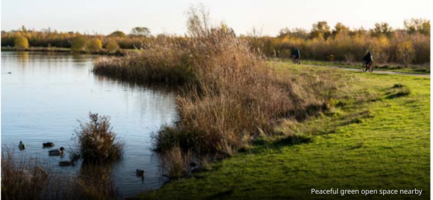
Peaceful green open space nearby

Commuters will benefit from the close proximity of East Midlands Parkway railway station for journeys to London and Nottingham. For trips further afield, East Midlands Airport is just 17 minutes away by car.