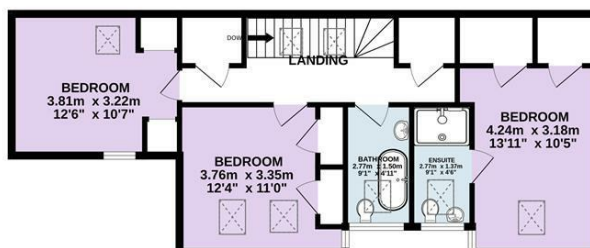
TOTAL FLOOR AREA: 134.2 sq.m. (1444 sq.ft.) approx.

Every attempt is made to ensure accuracy, however all measurements are approximate. This plan is for illustrative purposes only and is not to scale. Made with Metropix ©2025