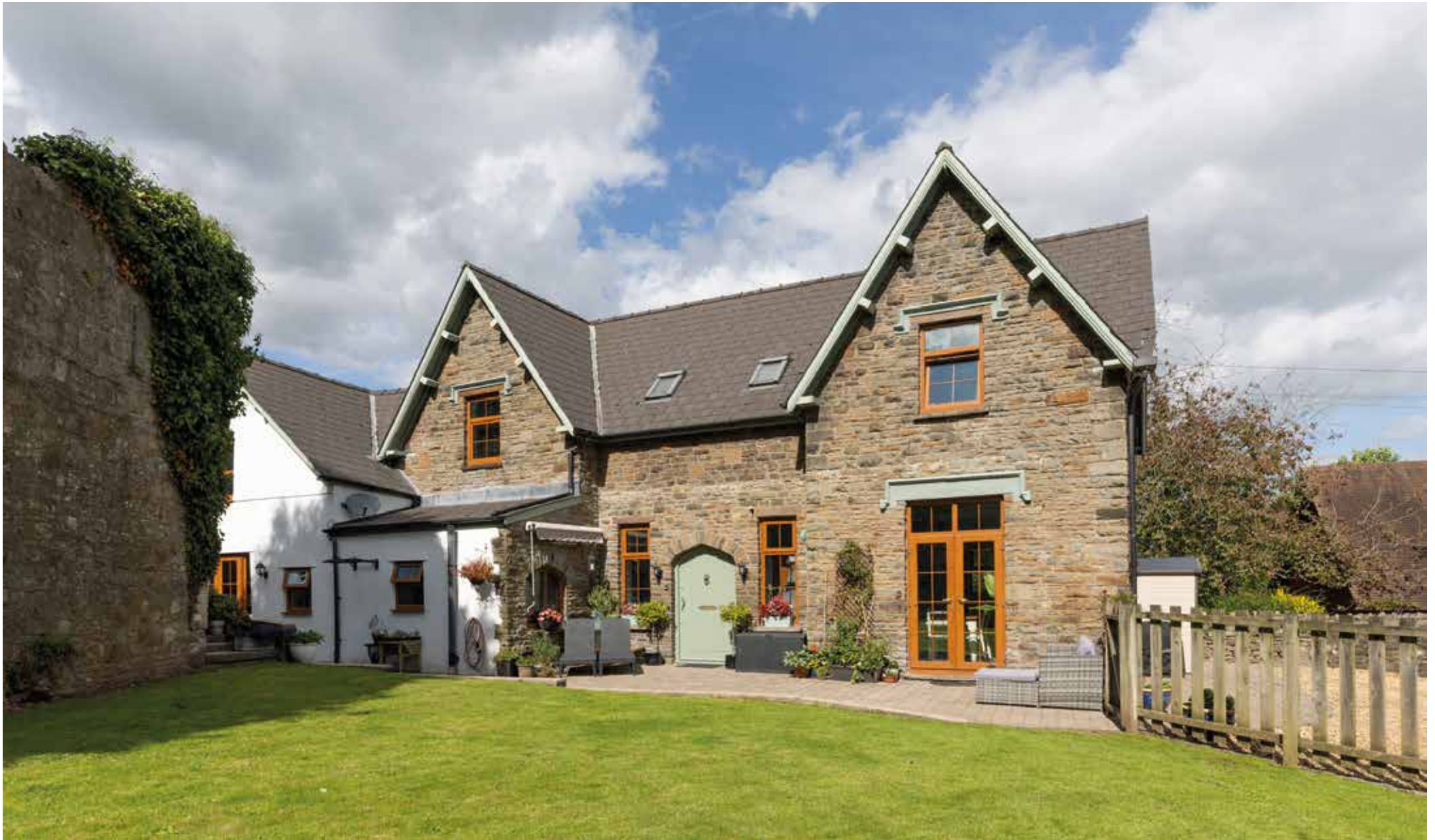
Wentloog Lodge Mill Lane | Castleton | Cardiff | CF3 2UT