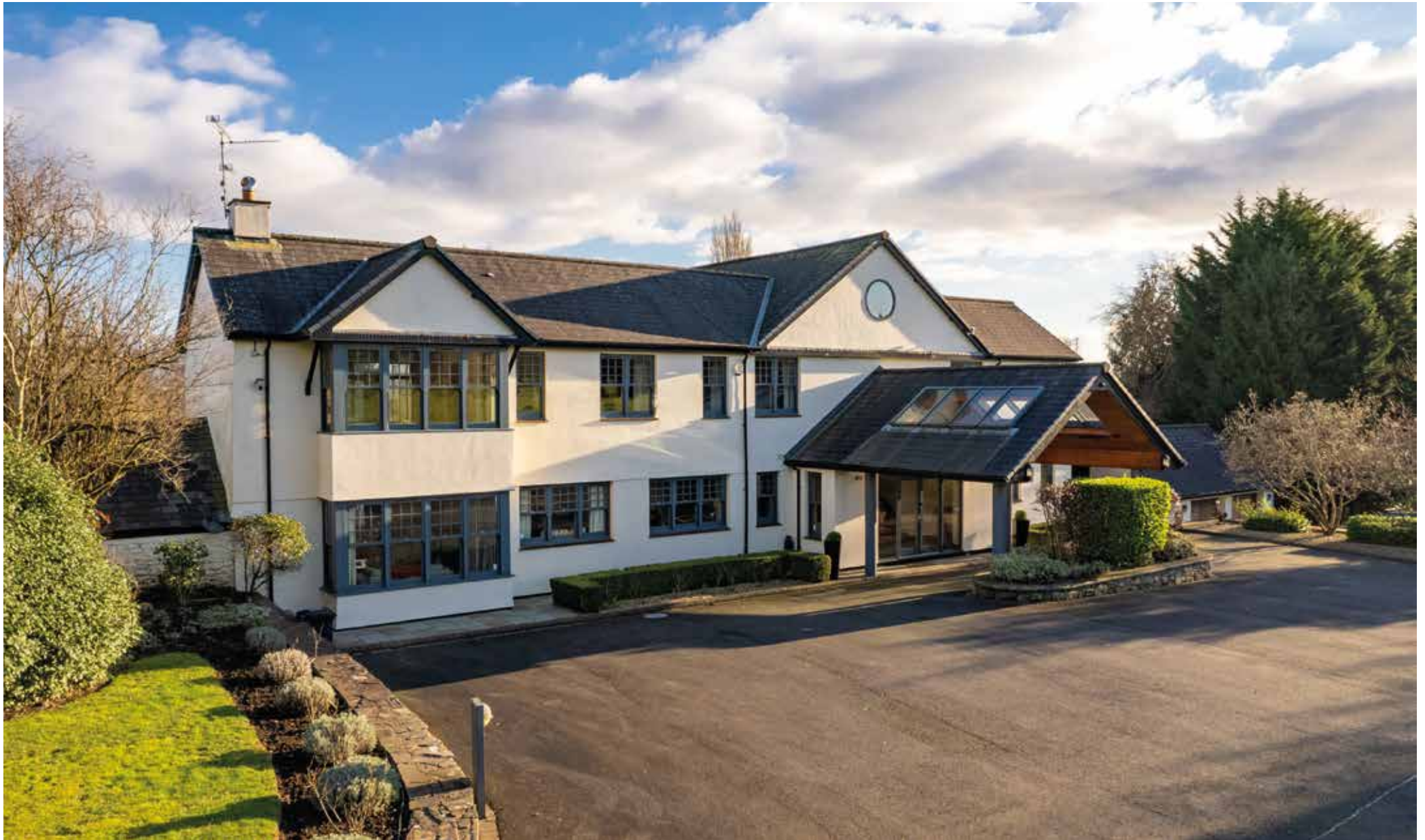
Heathcliffe House Newport Road | Castleton | Cardiff | CF3 2UN