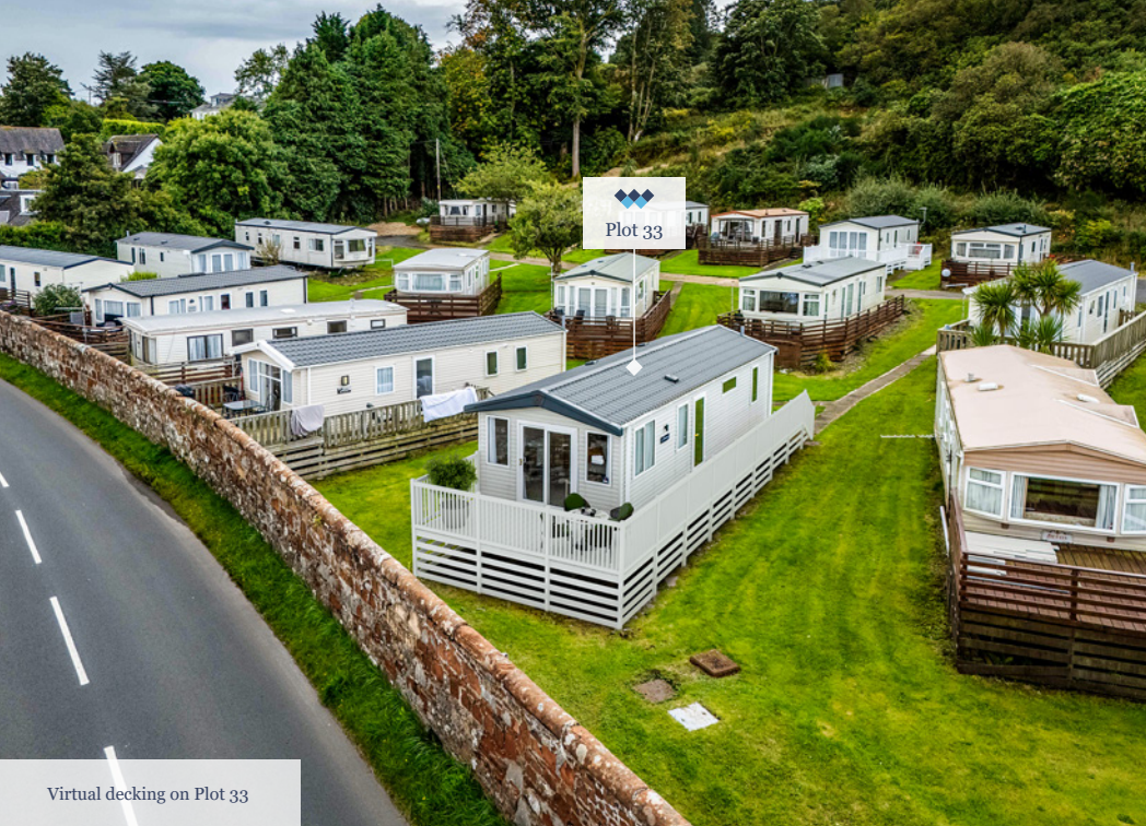
Virtual decking on Plot 33