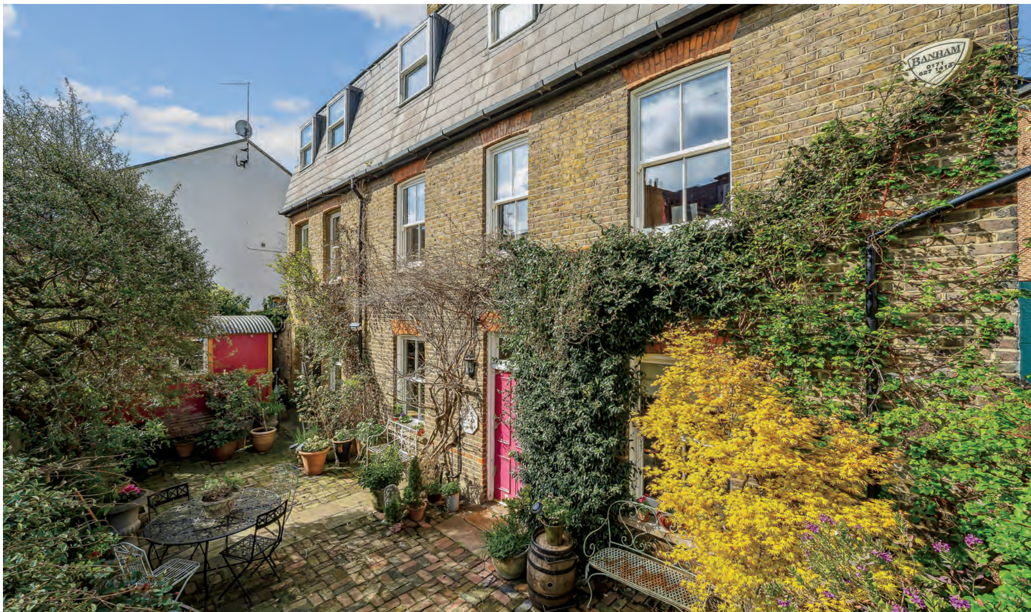
Victoria Cottage 46 Battersea High Street | London | SW11 3HX