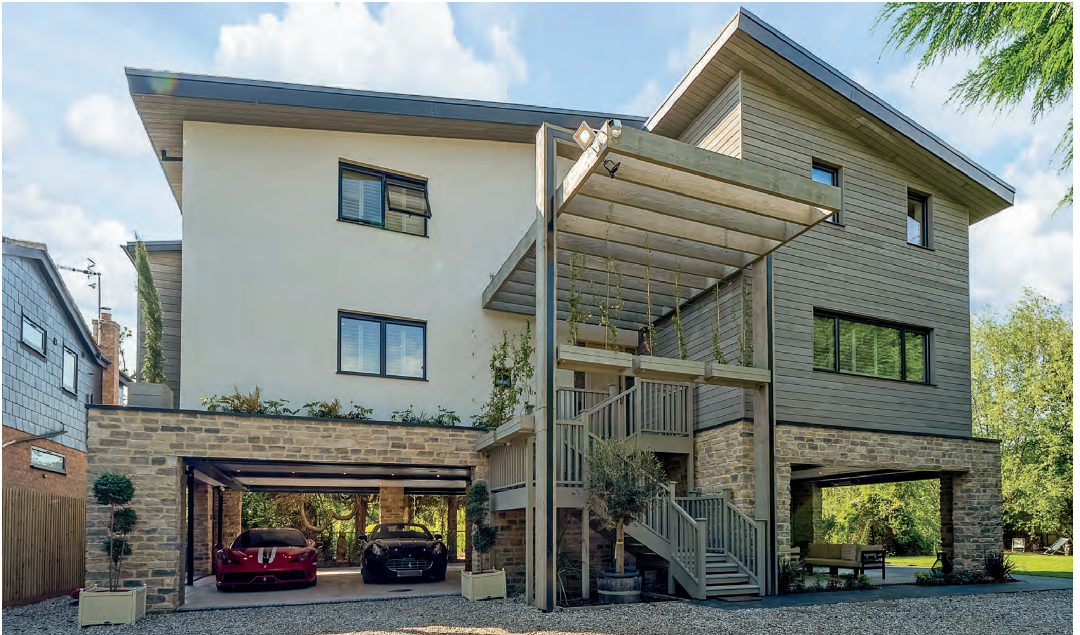
Birgan Lodge Riverside | off Tiddington Road | Stratford Upon Avon | CV37 7BD