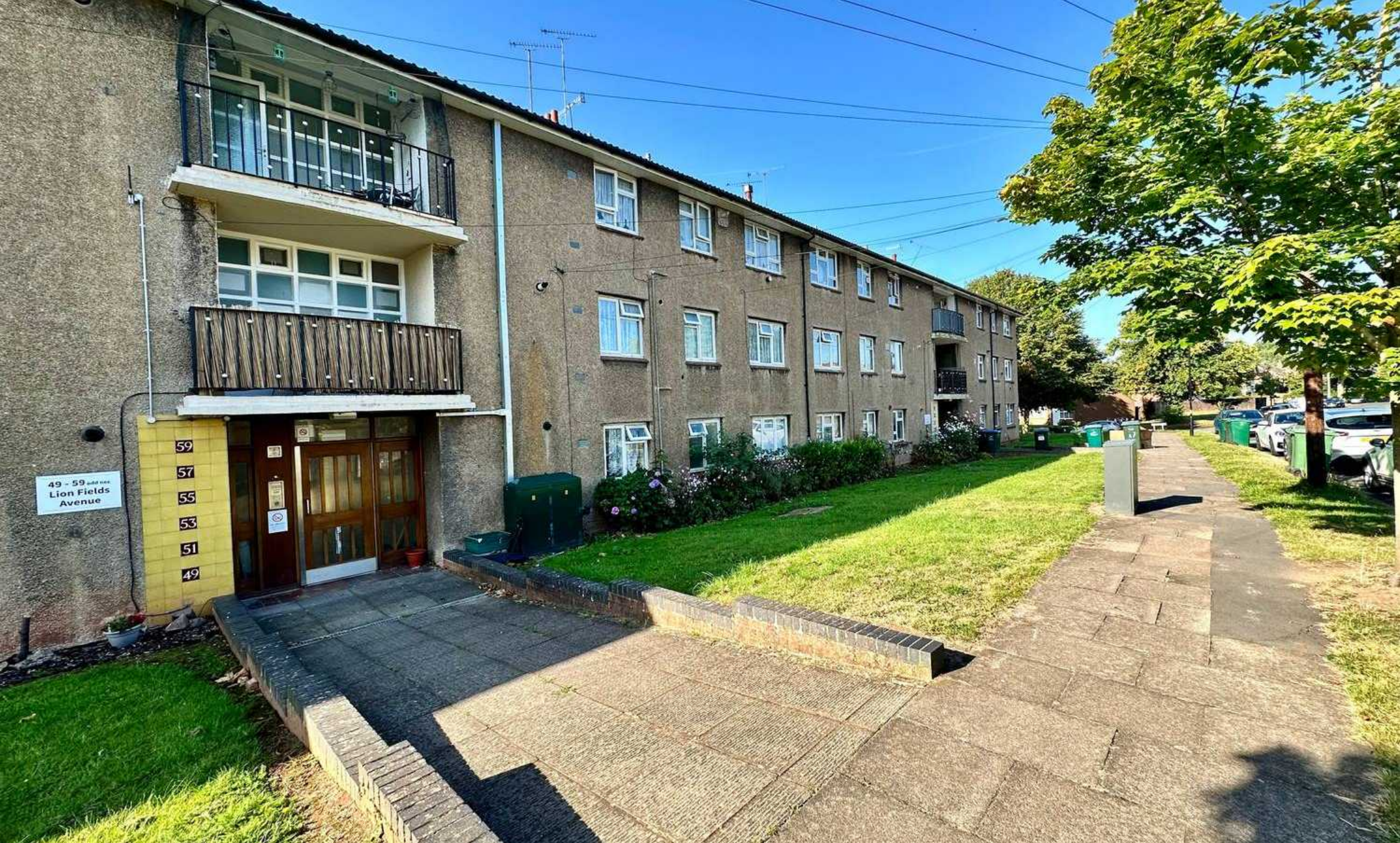
51 Lion Fields Avenue, Coventry £900 pcm