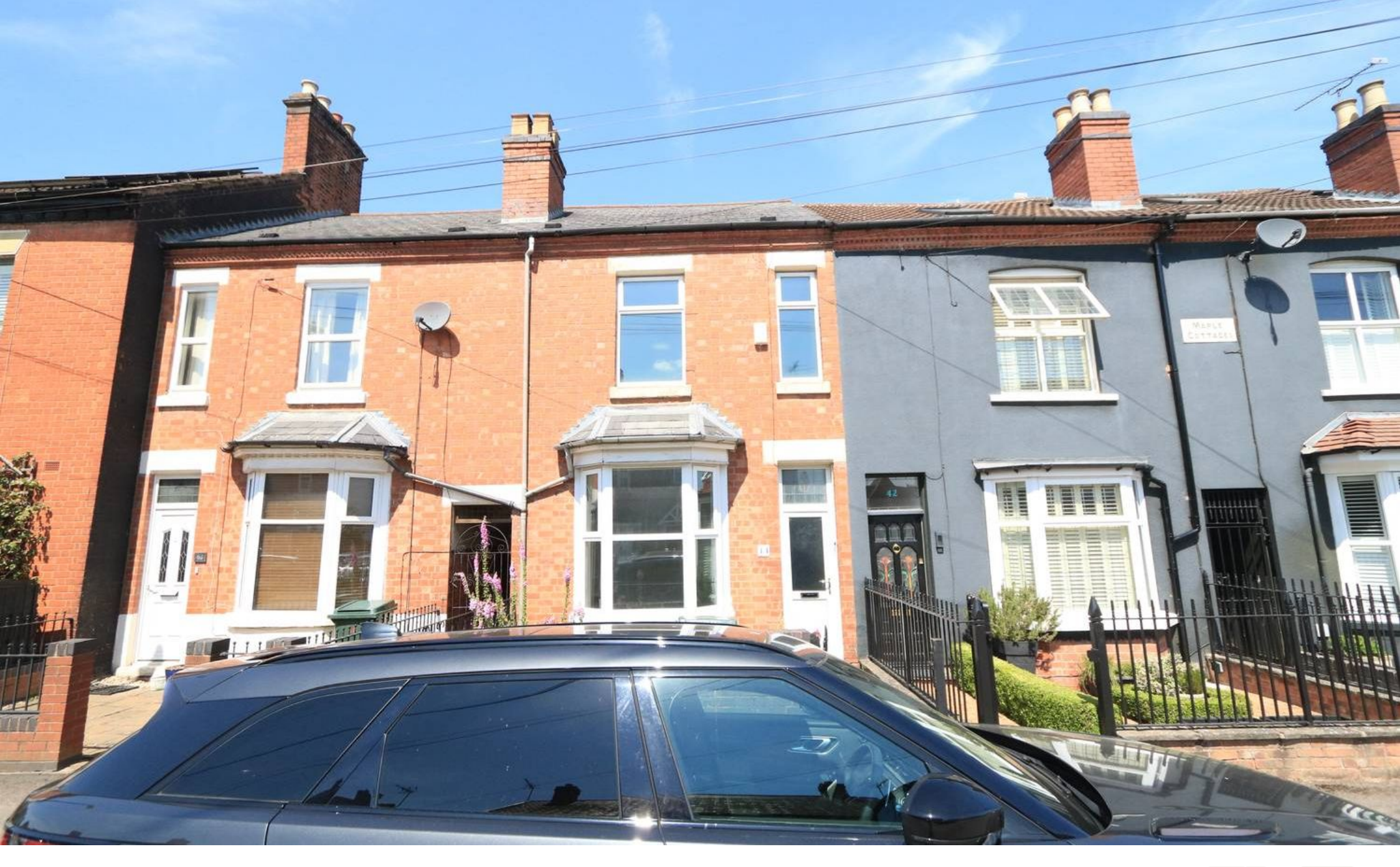
44 Clarendon Street, Coventry Fixed Price £1,495 pcm