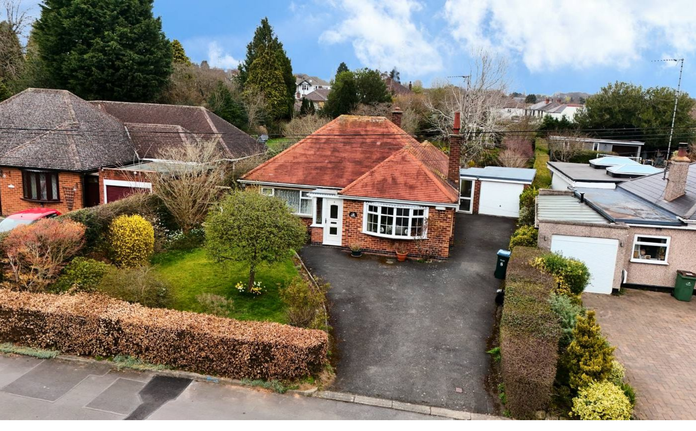
8 Bott Road, Coventry In Excess of £465,000