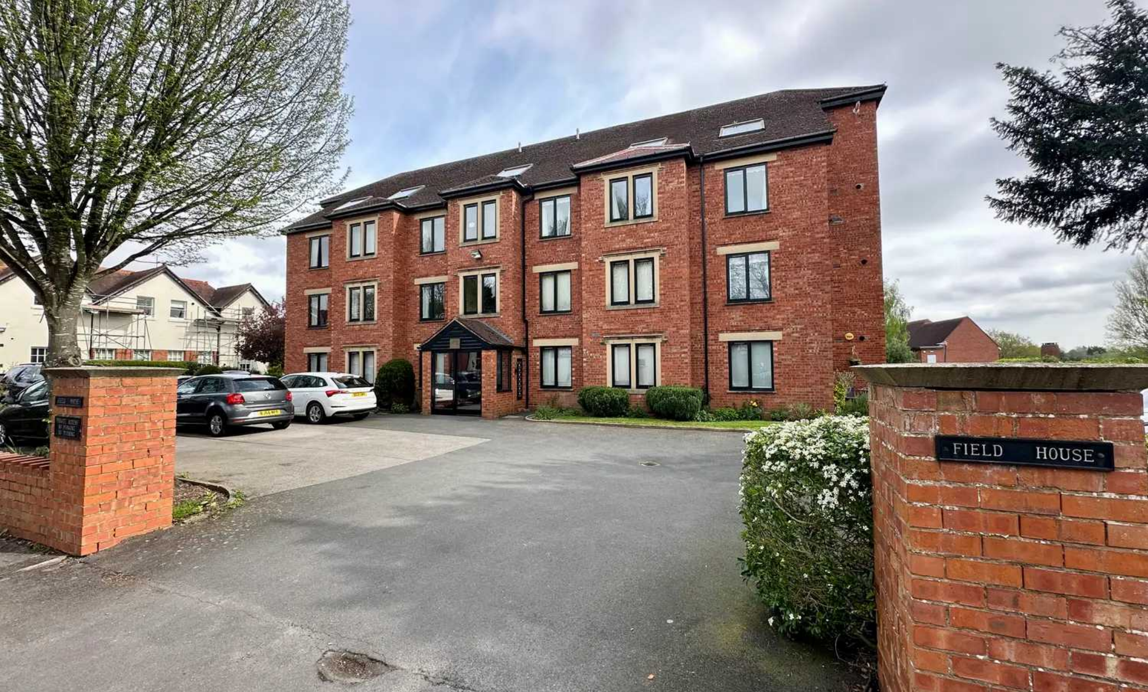
Flat 14, Field House Priory Road, Kenilworth £1,000 pcm