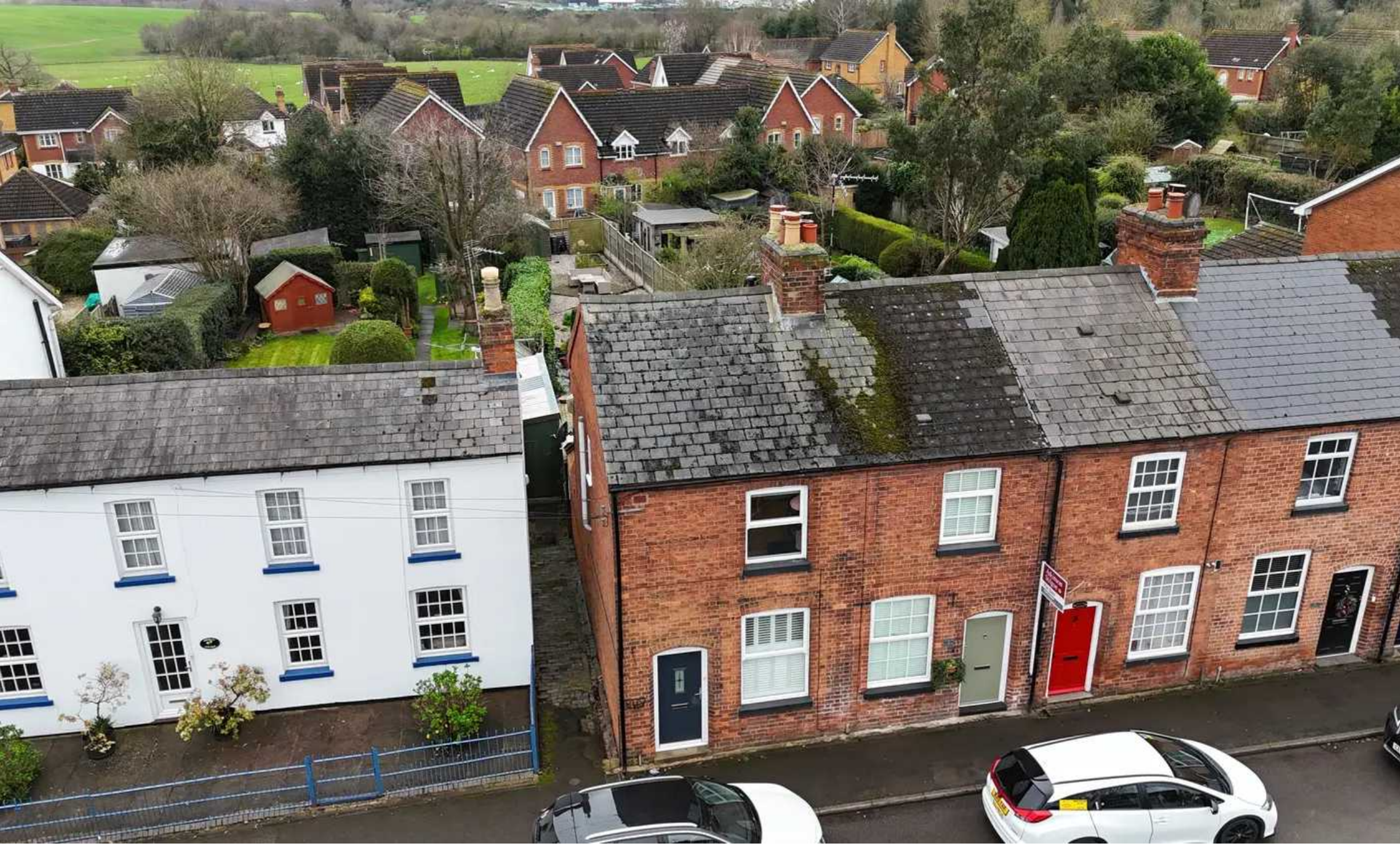
1 Darlaston Row The Green, Meriden In Excess of £279,999