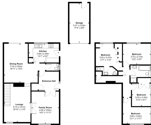
Total Area: 149.2 sq. ft. ... 1606 sq. ft. All measurements are approximate and for display purposes only.