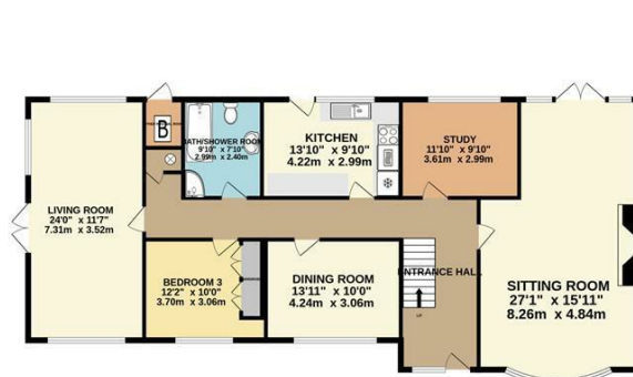
1ST FLOOR 956 sq.ft. (88.8 sq.m.) approx.