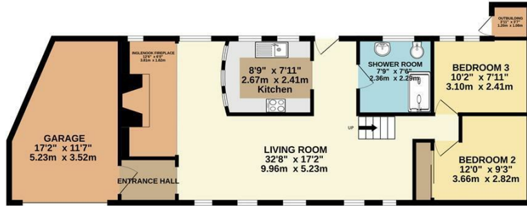
GROUND FLOOR 900 sq.ft. (83.6 sq.m.) approx.