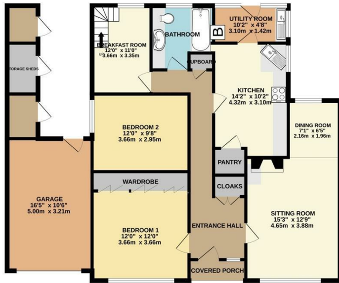
GROUND FLOOR 1201 sq.ft. (111.6 sq.m.) approx.