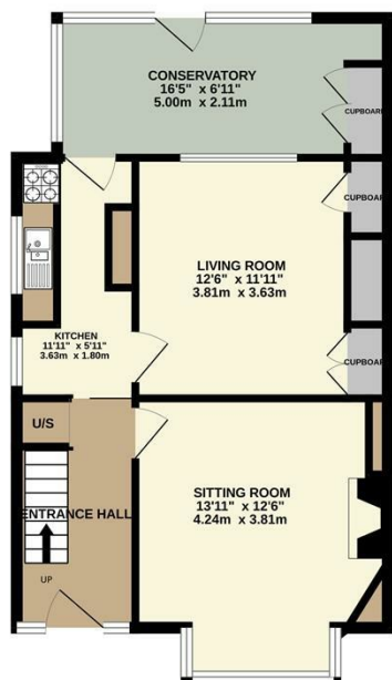
1ST FLOOR 424 sq.ft. (39.4 sq.m.) approx.