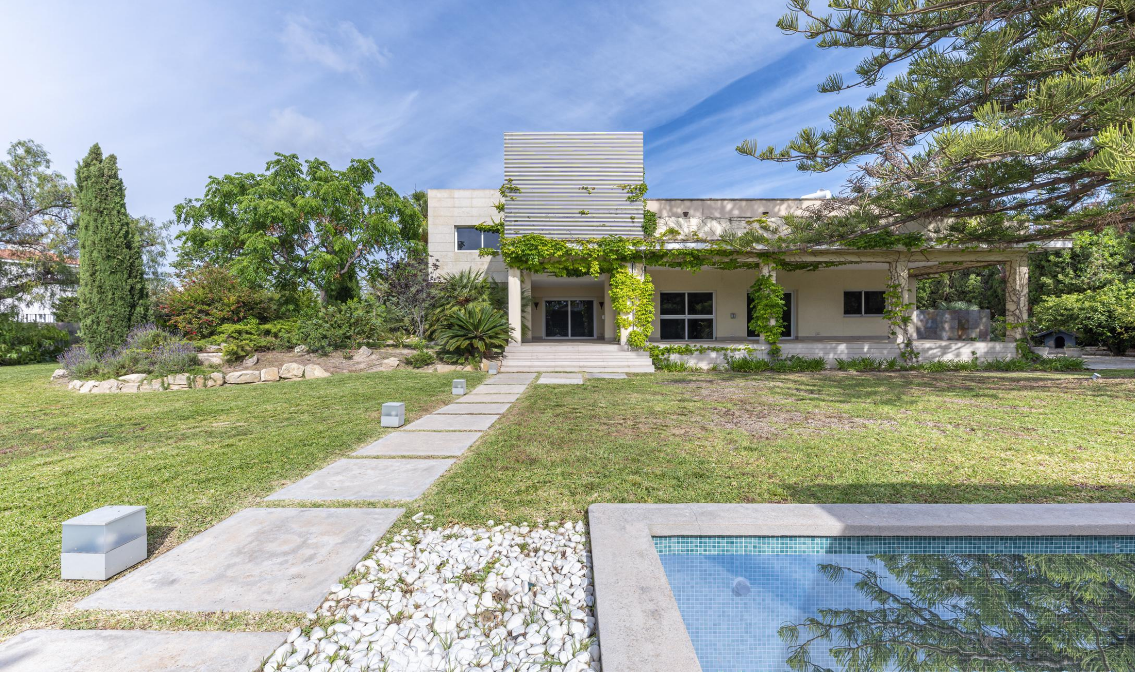
Modern Villa with Garden and Pool in Campello

Campello - La Font - Alicante - Comunidad Valenciana