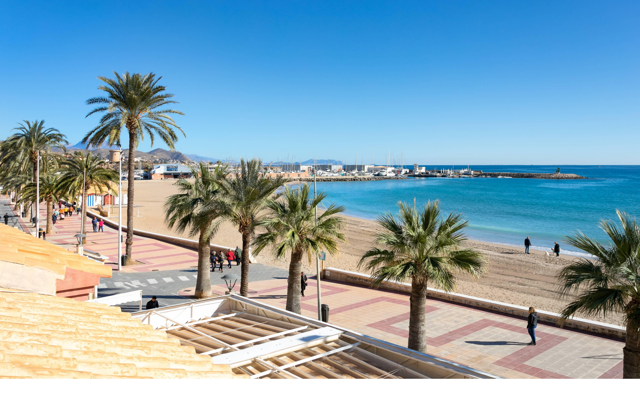
Mediterranean Villa in front of the sea in Campello

Campello - Alicante - Comunidad Valenciana