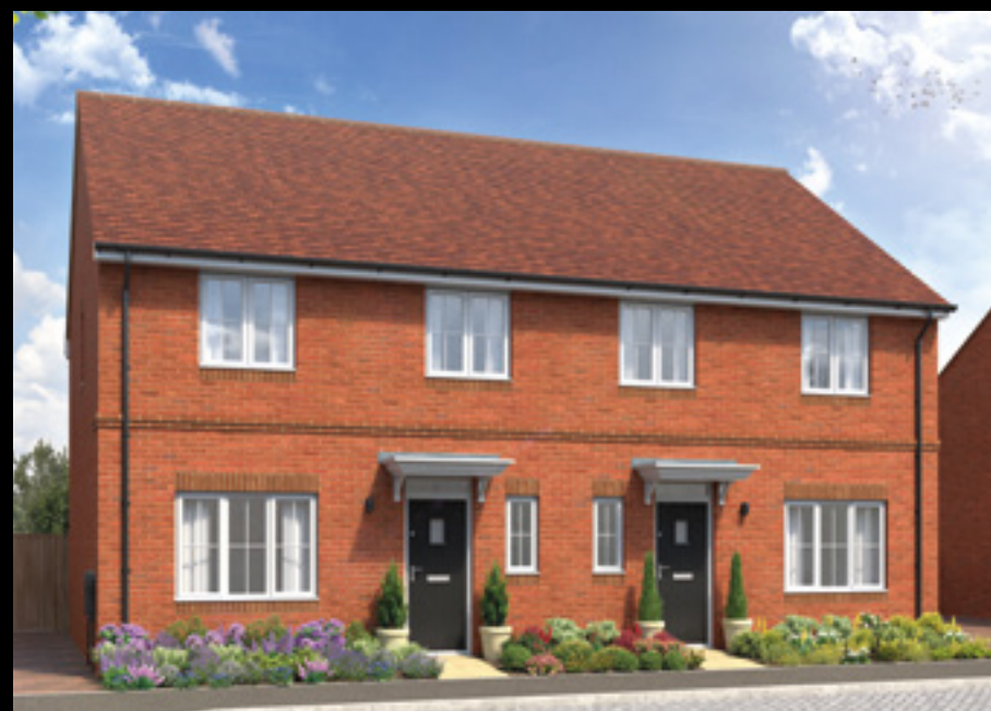
The Himscot 3 bedroom detached & semi-detached home with garage