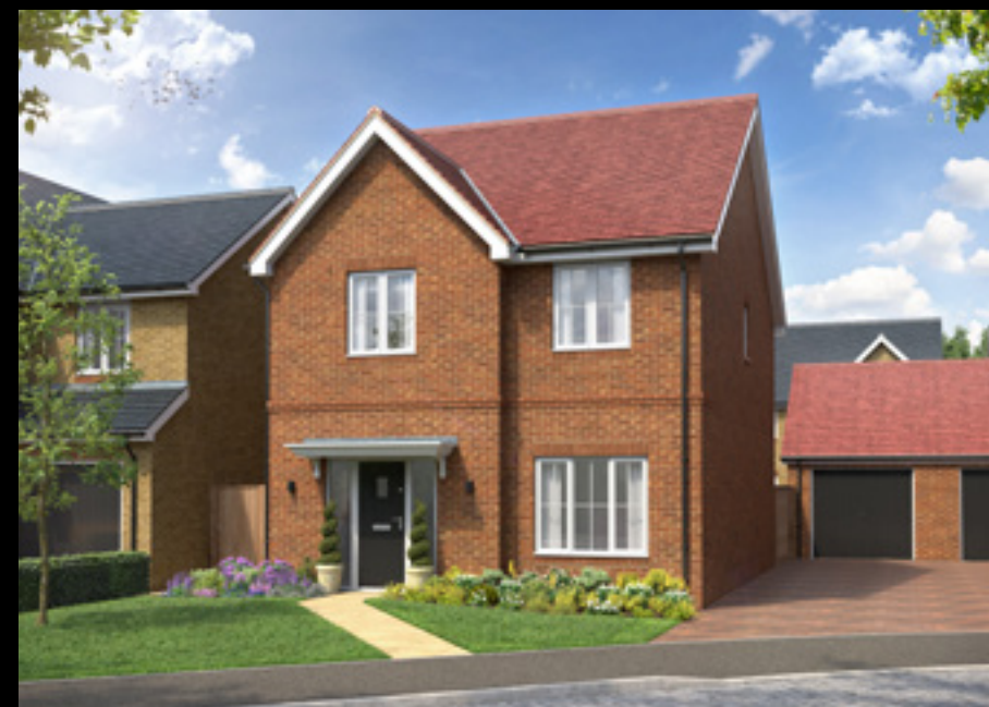
The Larfield 4 bedroom detached home with garage