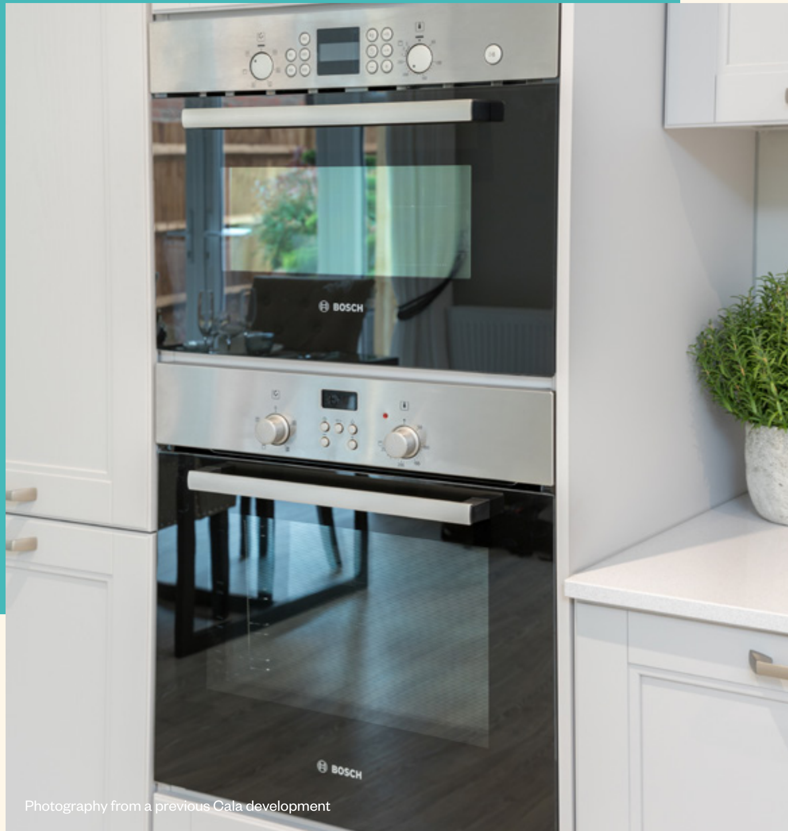
Photography from a previous Cala development