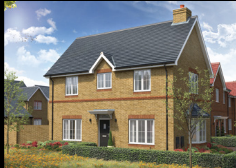
The Lanmead 4 bedroom detached home with integral garage