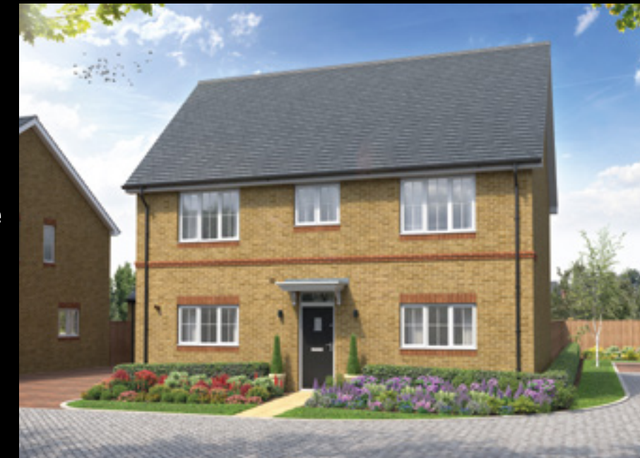
The Lenham 4 bedroom detached home with garage