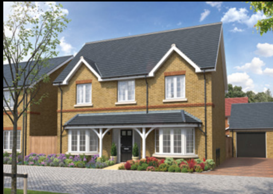
The Notley 5 bedroom detached home with garage