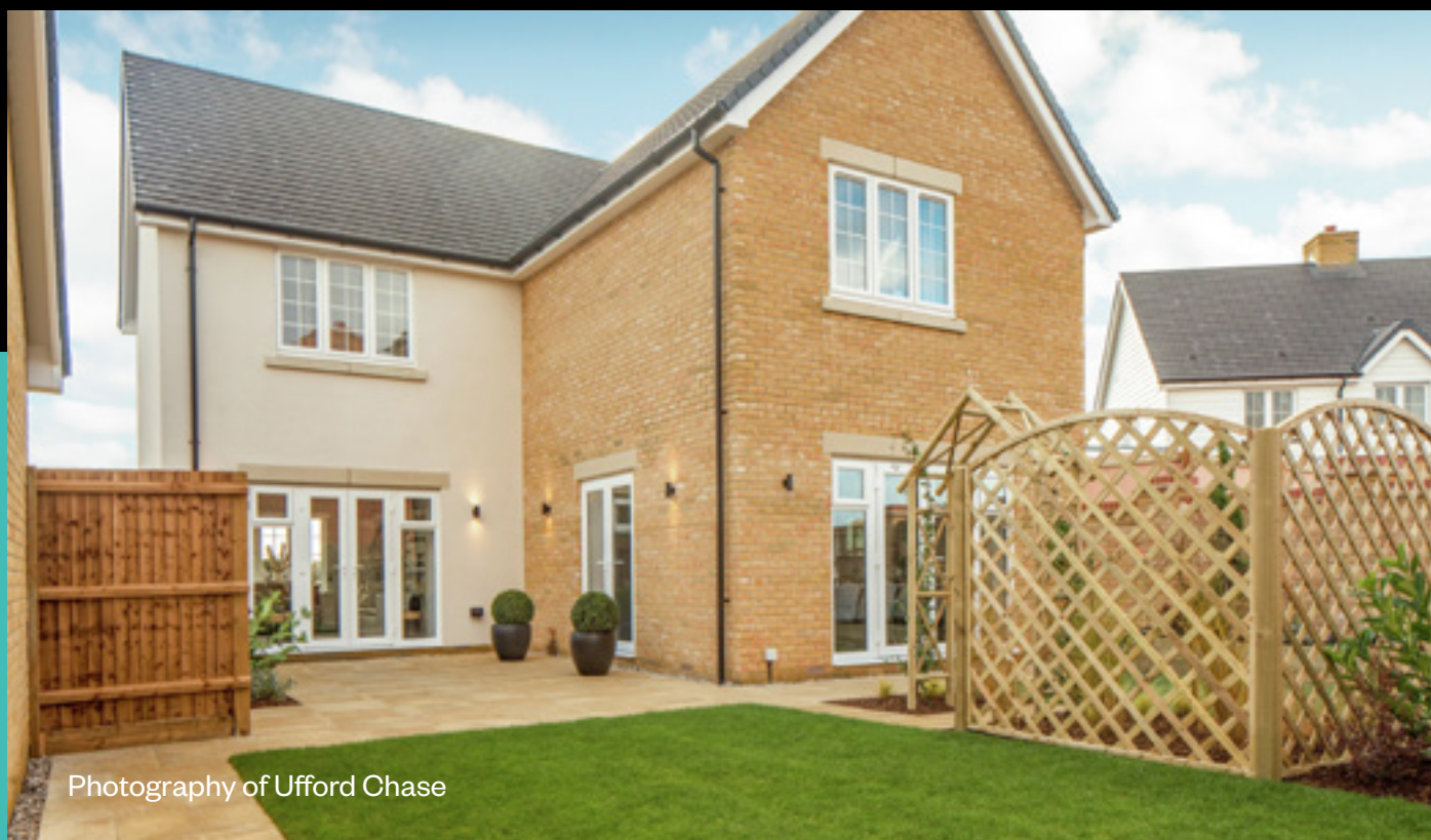
Photography of Ufford Chase