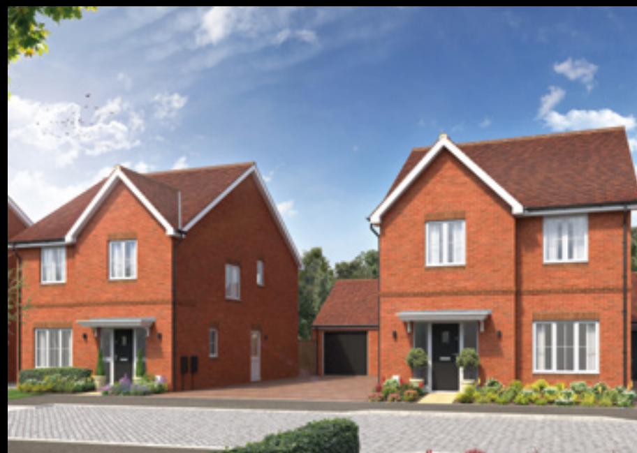
The Kinfield 4 bedroom detached home with garage