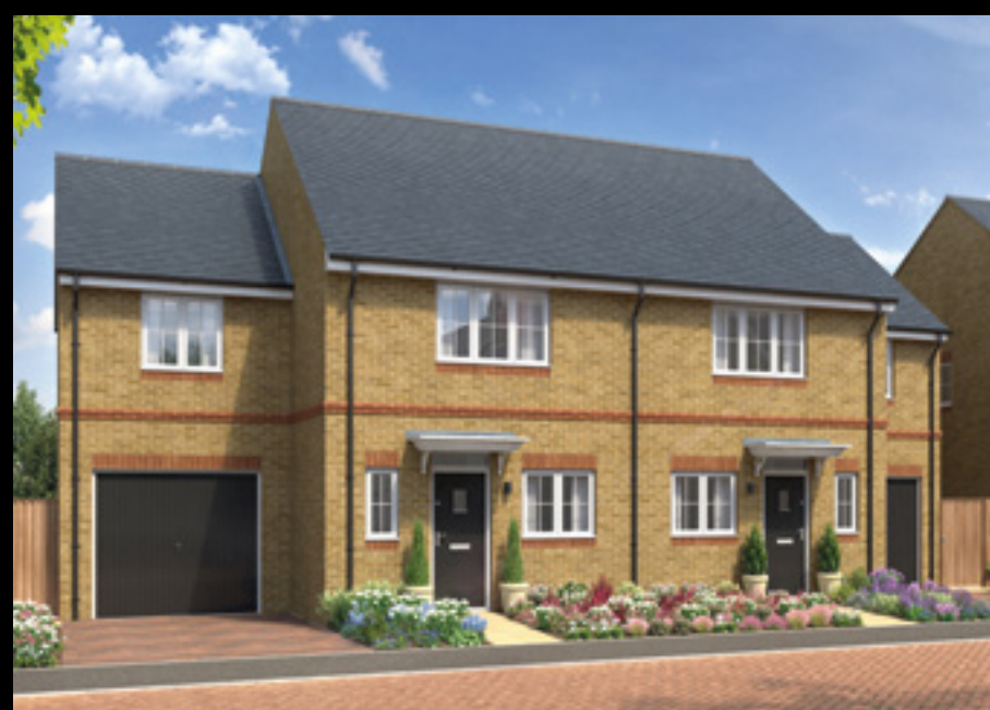
The Hornford 3 bedroom detached & semi-detached home with garage