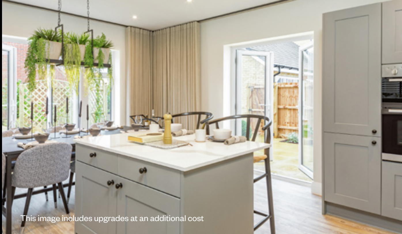
This image includes upgrades at an additional cost