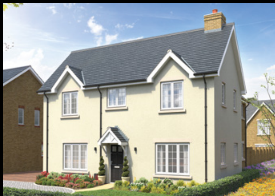
The Nessvale 4 bedroom detached home with garage