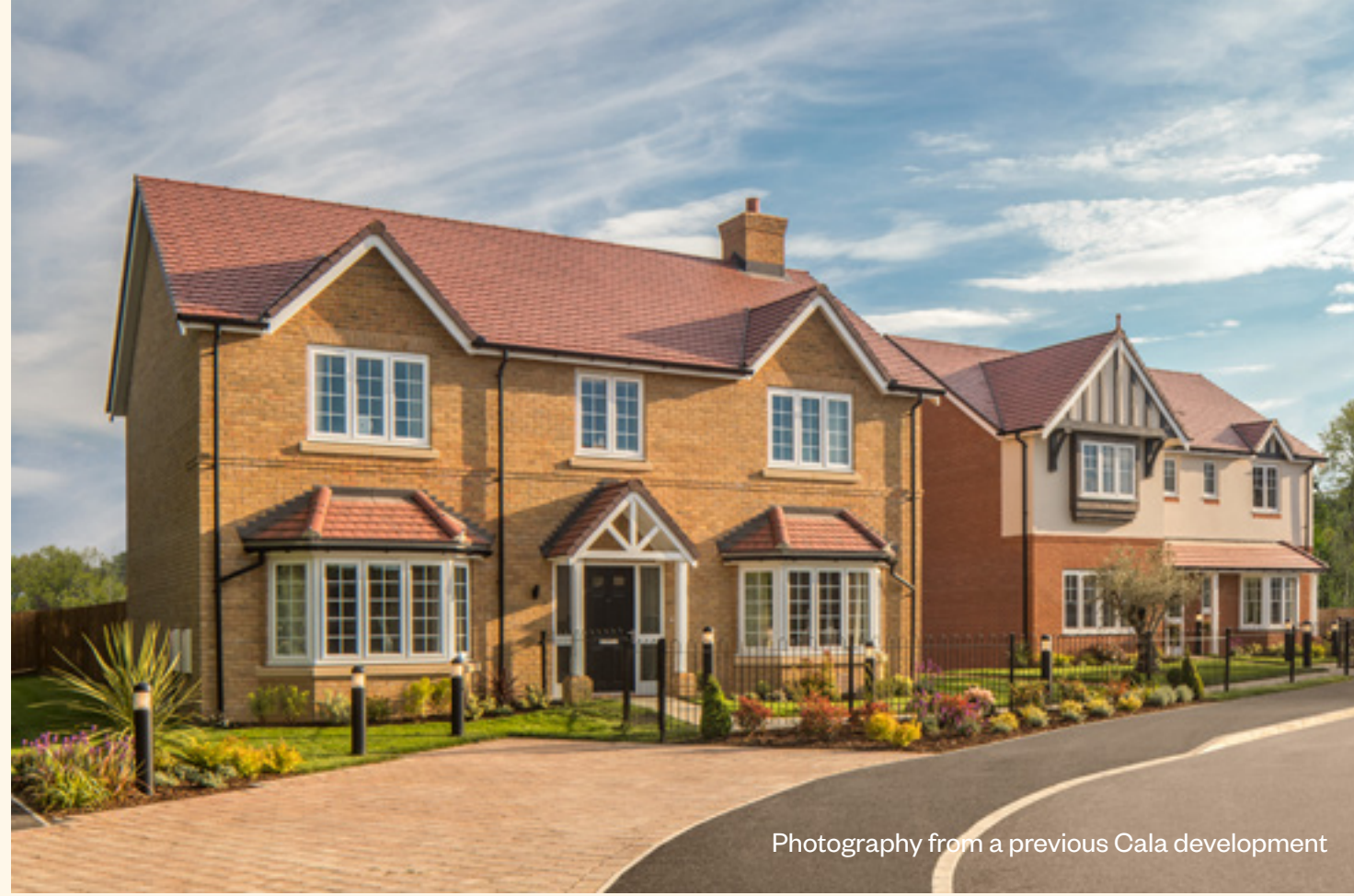
Photography from a previous Cala development