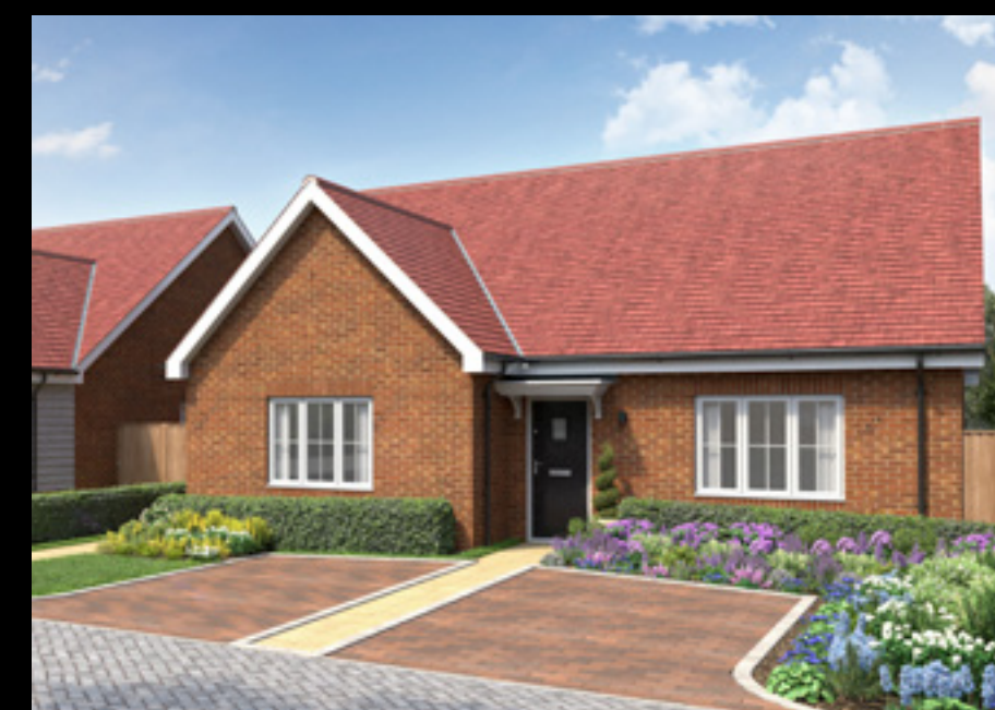
The Tendring 2 bedroom detached & semi-detached bungalow with 3rd bedroom/ study