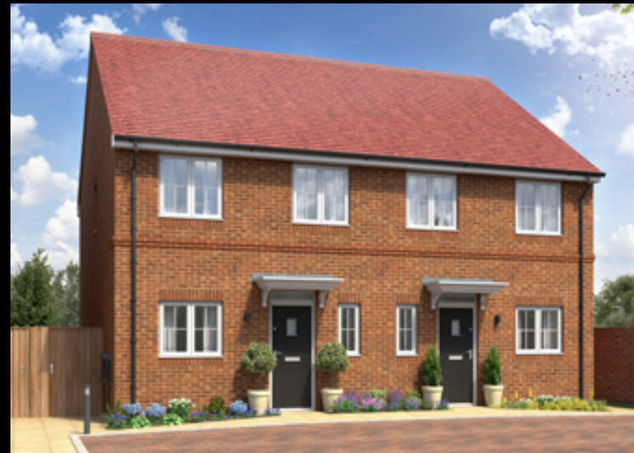
The Gosfield 3 bedroom semi-detached home