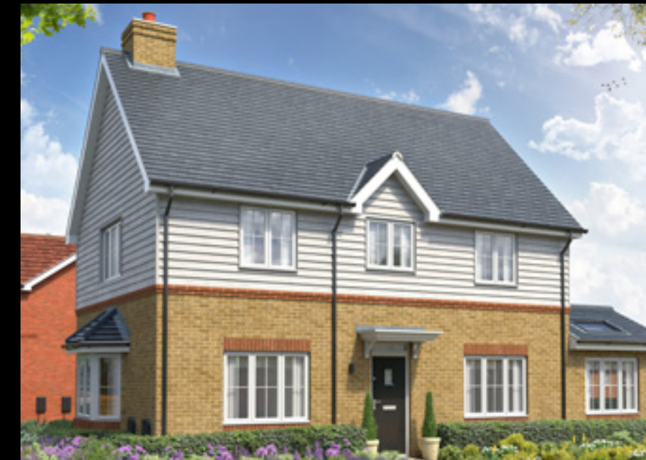
The Kiswick 3 bedroom detached home with garage