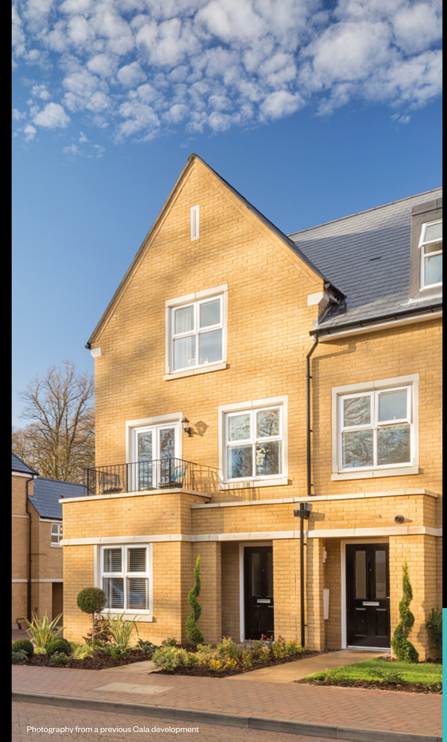
Photography from a previous Cala development