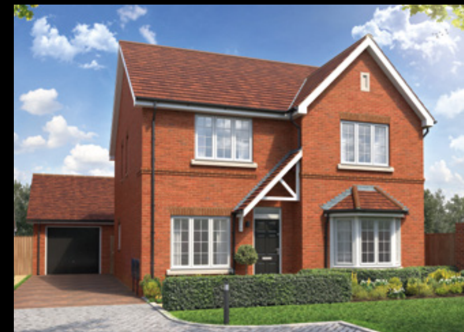
The Nenhurst 4 bedroom detached home with garage