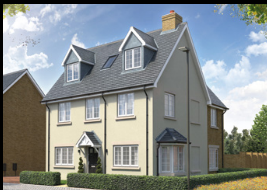
The Oatvale 4 bedroom detached home with study & garage