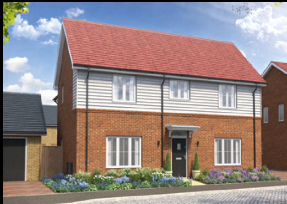
The Nessfield 4 bedroom detached home with garage