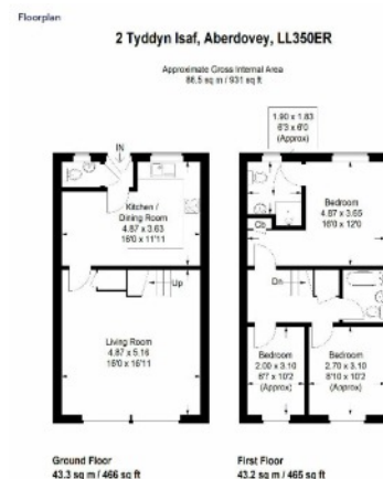
Illustration for identification purposes only. measurements are approximate, not to scale.

All measurements have been taken using a laser tape measure and therefore may be subject to a small margin of error.