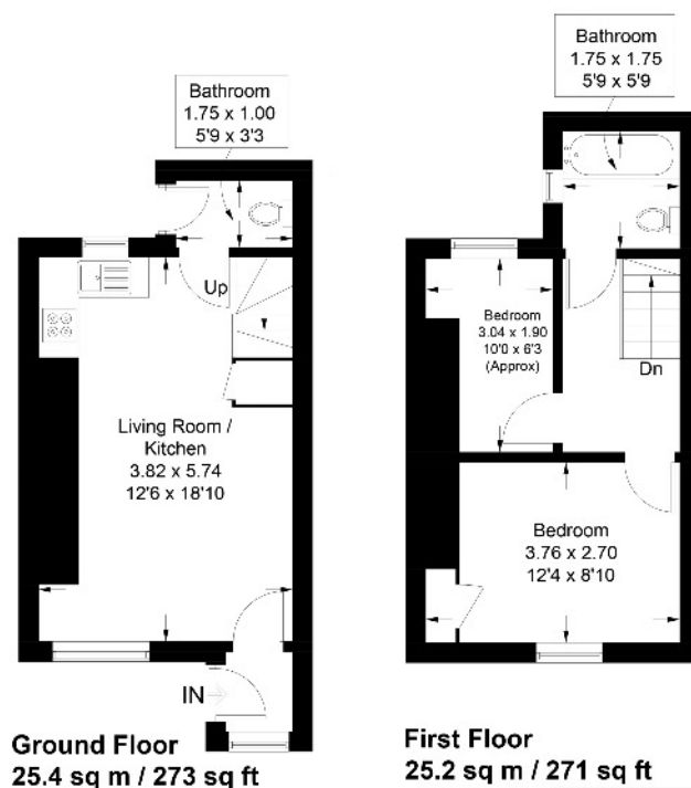
Illustration for identification purposes only. measurements are approximate, not to scale.

Approximate Gross Internal Area 50.6 sq m / 544 sq ft