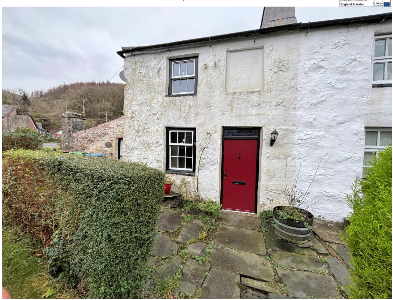
End terrace 1 bedroom cottage Situated in the heart of the village In need of renovation. Parking for one car. Front and side terrace