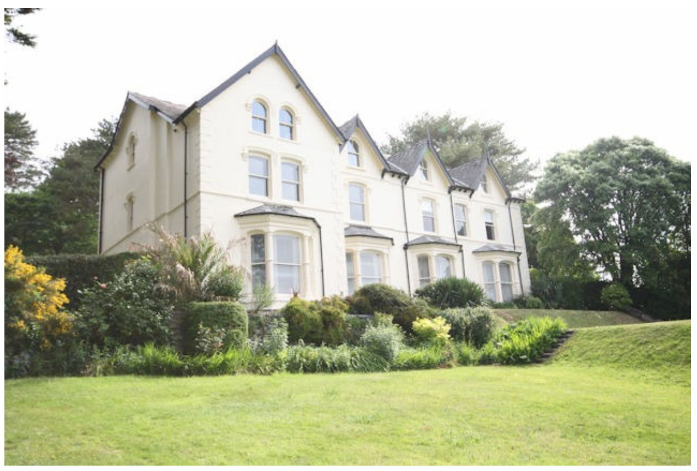
Well presented two double bedroom apartment In a country house set in communal grounds extending to approximately 2 acres with sea views. Leasehold with a share of the freehold. Contents negotiable