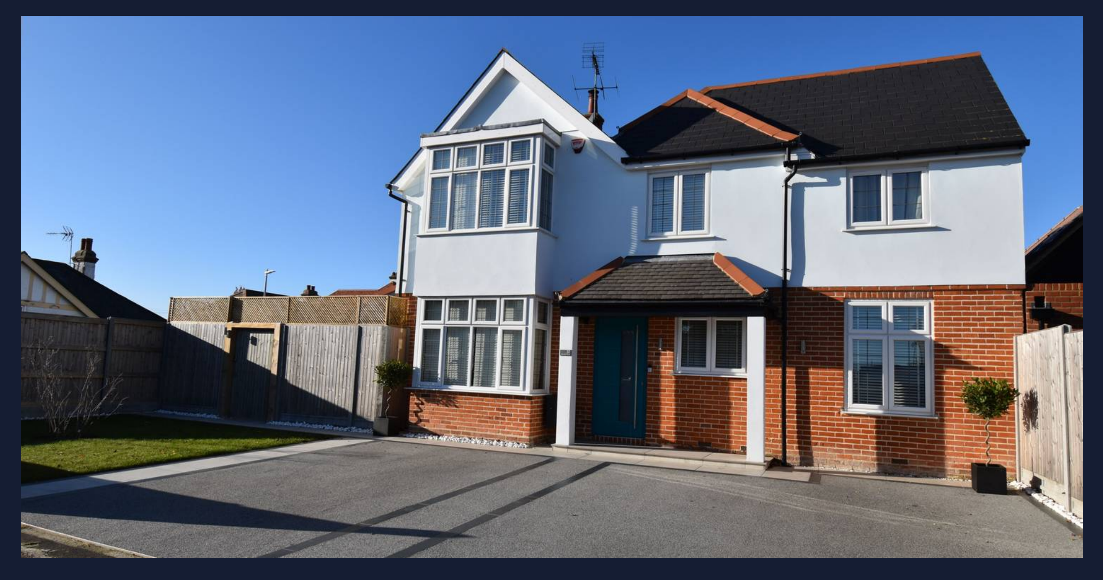
37 St. Annes Road, Whitstable Whitstable