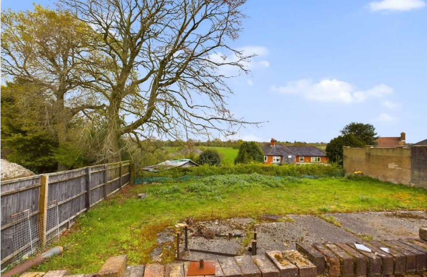
Council Tax Band F EPC E