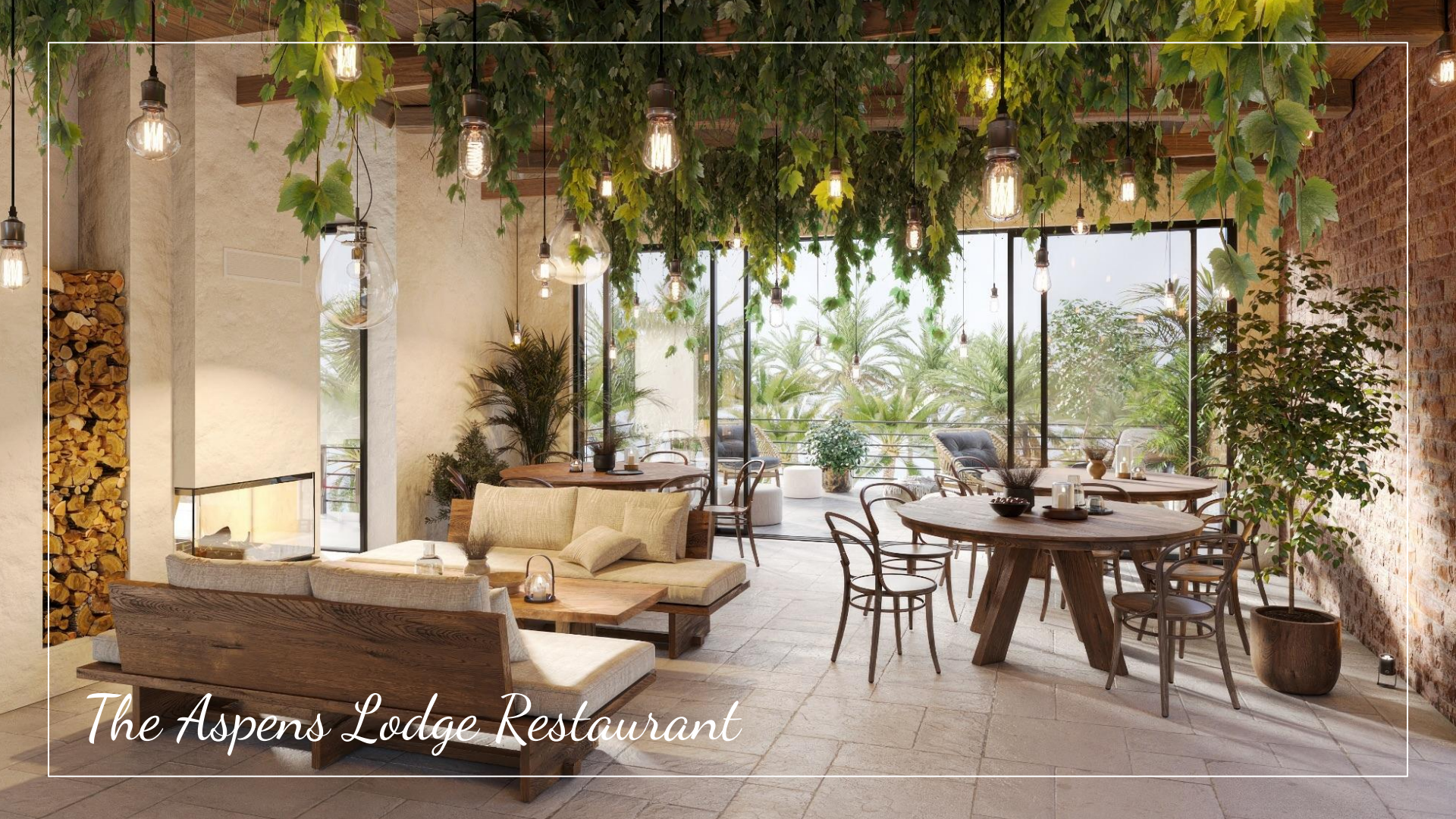
The Aspens Lodge Restaurant