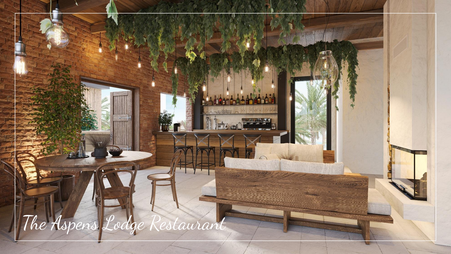
The Aspens Lodge Restaurant