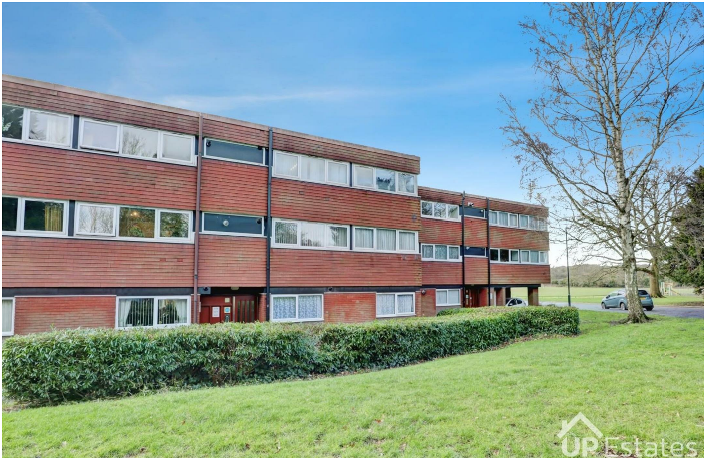
Cleaver Gardens, Weddington, Nuneaton